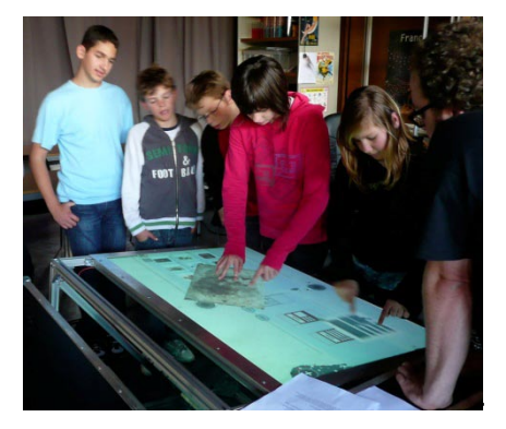
Fig. 3. Students working on the multi-touch setup.

A brief explanation of the main operations and possibilities were sufficient for the three students to start the assignment. They had no additional help during the creation and instructed the other students easily at using the table. In particular, the peer-to-peer learning and collaborative working skills were frequently addressed during this test. When asked for comparing collaboration using computers versus a shared multi-touch surface, the students primarily noted that when using a mouse one person controls the whole collaboration while the multi-touch setup did not impose such leadership. Note the tasks at hand (research, creation and presentation) are well suited for collaboration, but traditional tools fail to exploit these