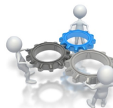
(5) Interaction individual - task - environment