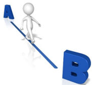
(3) A yes or no RTS decision only at the hypothetical "end" of the rehabilitation