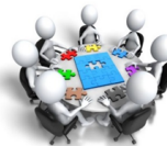
(7) Shared decision