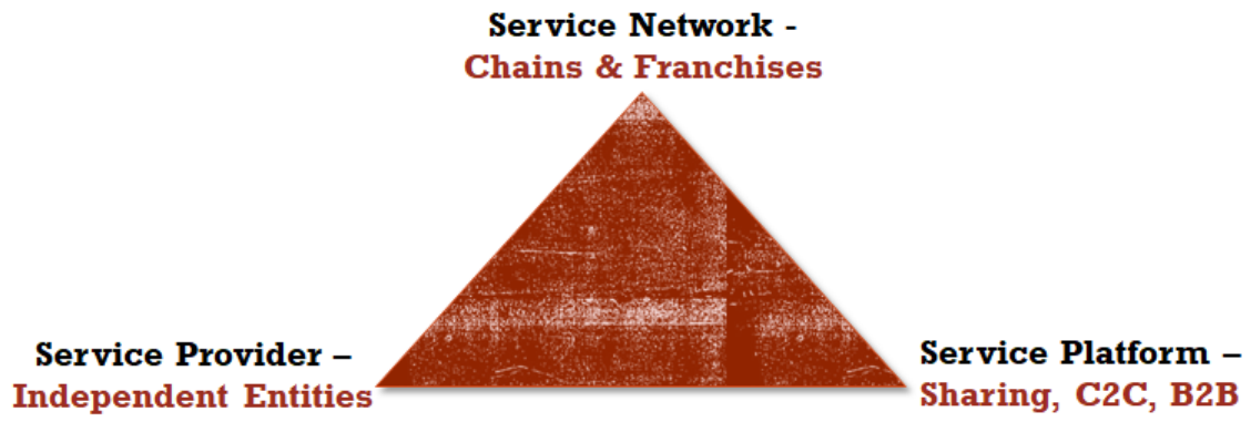
Figure II: The alternative strategic configurations for a service provider