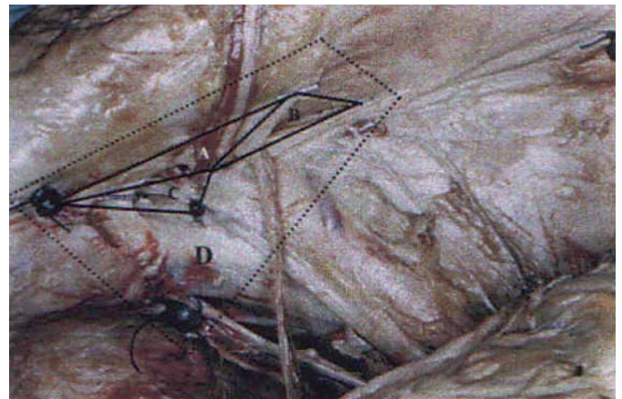
Fig. 2. Hernia site surface.

One may estimate that the abdominal wall, the hernia site and the mesh have a semi-lunar shape. On a circular defect in the abdominal wall, covered by the prosthesis (fig. 3), a centrifugal pressure force is exerted by the intra-abdominal pressure on each infinitesimal small part of the mesh. This force is counteracted by the surface tension of the mesh. Considering the entire abdominal wall, by substitution one can deduce a formula to identify the size of the mesh.