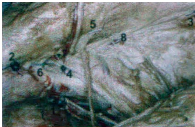
Fig. 1. Radio-opaque markings delineating the anatomical structures and hernia sites. 1 = Obturator canal; 2 = pubic tuberculum; 3 = ileopubic tract; 4 = right superior pubis; 5 = upper limit interfoveolar ligament; 6 = medial ending ileopubic tract (medial of femoral canal); 7 = crossing of inferior epigastric artery, veins and ileopubic tract; 8 = lateral ending of arc of transverse abdominal muscle.

By means of classical physical methods, a model was then developed to formulate the ideal size of the prosthesis, with the aim of placing it without stapling and preventing neurovascular complications.