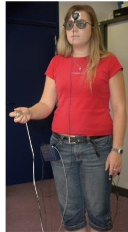
(b) Utilization of user's physiological measures