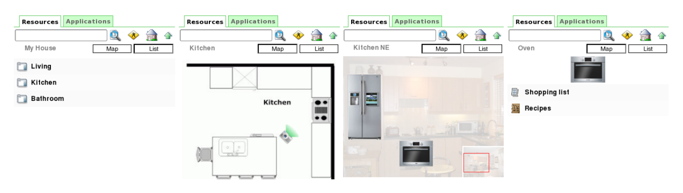
Figure 4. A combination of list- and photo-based views provide access to the resources embedded in the environment. From left to right, these views show a list of places and resources; an interactive floorplan of a place with a sight reference on it; an interactive sight on which resources are marked; a list of applications associated with a selected resource.

pictures of resources. In dense places with many resources, z-orderings help to differentiate between nearby resources and resources further away. However, we acknowledge that we currently do not take into account resources which are completely occluded by other resources; this situation should be avoided when taking a picture, if possible.