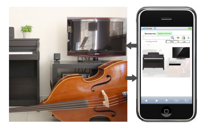
Figure 1. In Pervasive Maps, a pervasive computing environment is represented by annotated photos that reveal the environment's resources and applications that provide access to related functionalities.

We propose Pervasive Maps (PM) as a scalable 'desktop' solution with integrated tools for modeling and interacting with pervasive environments. Pervasive Maps tries to simplify end-user control over a pervasive environment not by abstracting it, but by adopting the most concrete representations one can find of such an environment: pictures. Studies have for instance shown that pictures assist people in finding their way in previously unexplored environments [12], [14]. End-users with no technical expertise can use the PM editor to create interactive user interfaces for navigating their environment by taking pictures of the environment and annotating them with spatial and resource-specific informations. Developers can also query the environment to discover available resources. A cornerstone of our approach is the decoupling of the complex technical side of a pervasive computing system and its end-user facade. The novel aspects are twofold. On the one hand, we include a step-bystep process, supported by a tool, that walks the end-user through the construction of a digital representation of the environment (section III). On the other hand, we present a Web interface for exploring a pervasive environment using variants of a classical file explorer and a 'start menu' (section IV). Furthermore, we discuss the architecture of PM (section V) and outline two case studies which illustrate how our approach can be used in practice (section VI).