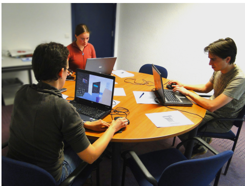
Figure 2: The experiment setup.

Although we designed this game to be played remotely, for observational reasons, participants were present in the same room (as shown in figure 2). During the experiment participants were allowed to communicate. Due to the co-located setup participants were able to talk to each other without using any communication technology (e.g. Skype). Because every participant was focused on actions happening on his monitor, other communication channels of real life (facial expressions, gestures, etc.) were not taken into account. Apart from voice communication they had a text messenger running on their laptops which was used to share already found digits to the partners. Once all 20 digits were found, one of the group members calculated their sum and selected the answer from the four-item menu (figure 1). Participants were supervised in order to avoid guessing the correct answer from the menu.