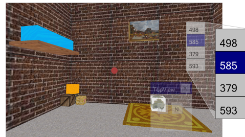
Figure 1: The task.

During the experiment ten groups of three people were sequentially asked to play a basic 3D game with the shared goal of collecting 20 digits in the environment together with two partners. The game was represented as an environment that consists of two virtual houses containing 20 cubes (figure 1). Half of these cubes had a digit on one of their sides. In order to complete the game participants were asked to calculate the sum of all digits, and then to select the correct number (corresponding to the calculated sum) out of four options, presented as a four-item menu. To explore the environment, participants had to select and manipulate objects.