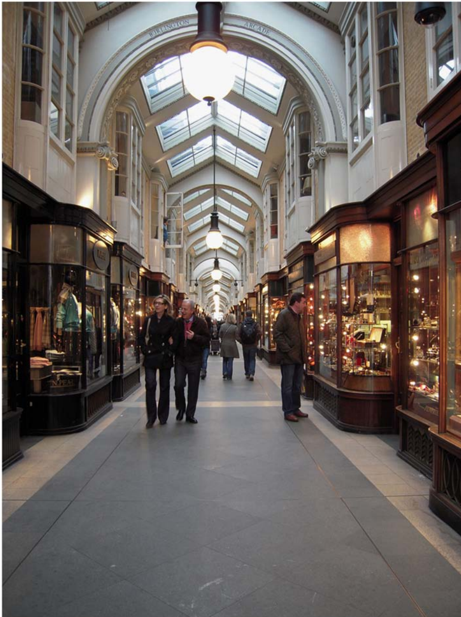
Plate 1. Burlington Arcade anno 2010

During the second phase (ca. 1840-ca.1930), the passages became higher and wider. Shops were usually located on the ground floor, and two or more floors above these shops were used for dwellings; a theater or hotel was often added to the program. New materials such as glass and iron influenced its architecture. A cupola was