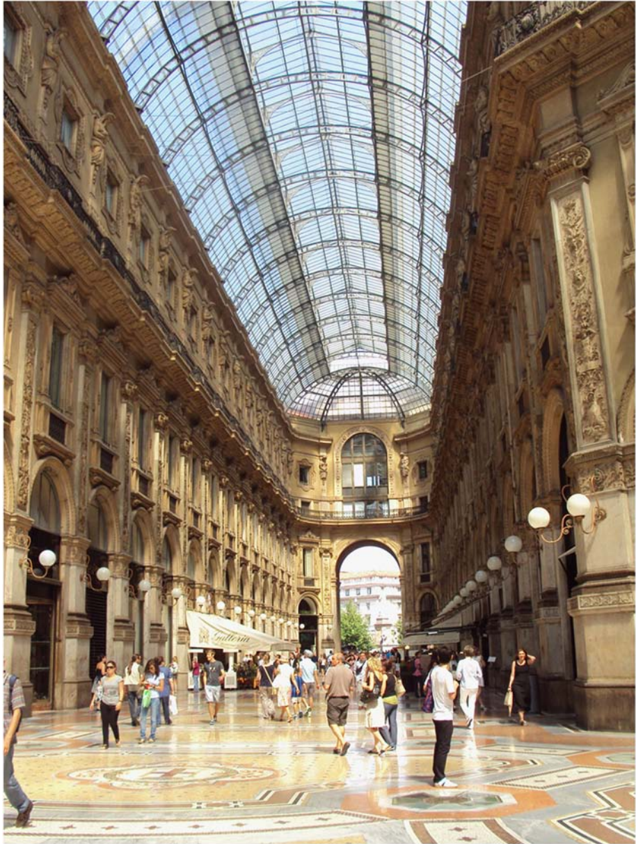
Plate 5. Galleria Vittorio Emanuele II anno 2010

Conservation and management: The material architectural evidence of the Galleria Vittorio Emanuele II has been very well preserved such as the flooring, decoration, glass roof but also interior features such as the original store fronts, lanterns and statues are still present (Flory and Paoli, 2003).