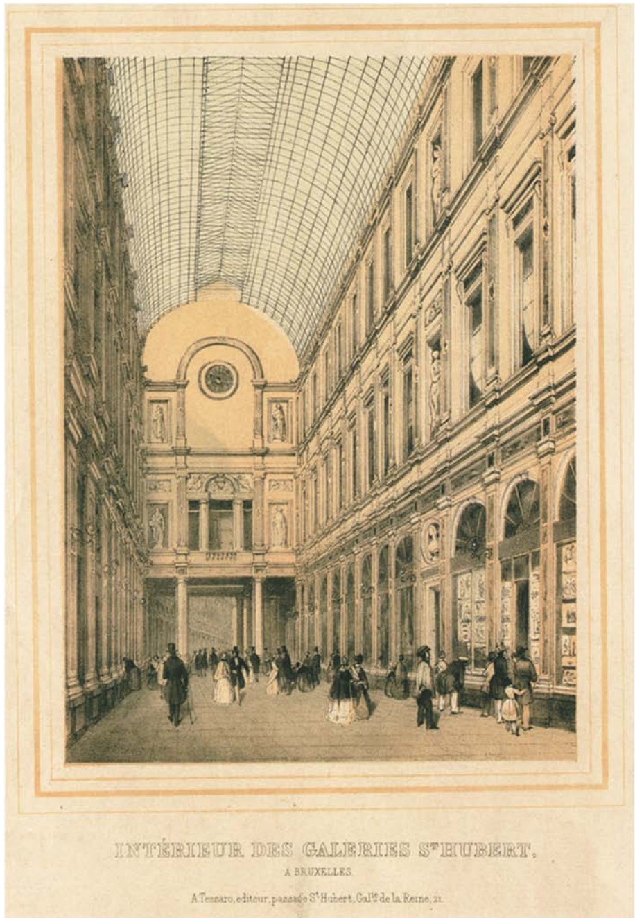
Plate 2. Lithography of Cannelle, ca. 1850 (Archive of Brussels city)