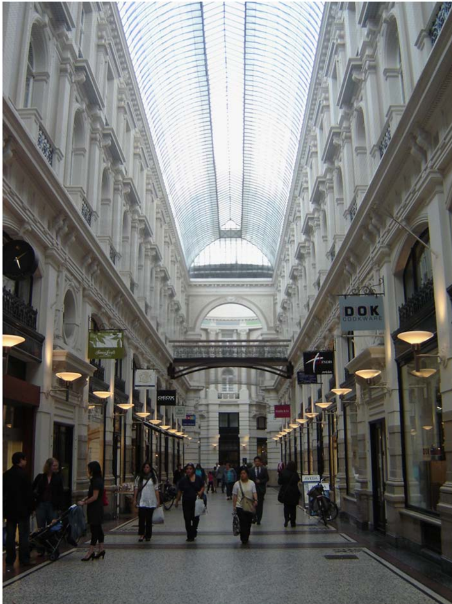
Plate 7. Passage anno 2008

brands or even outlet stores, most of them furnished like any other store of the brand. As a result, the Passage failed to maintain its original grandeur and prestige, unlike Milan and Brussels.