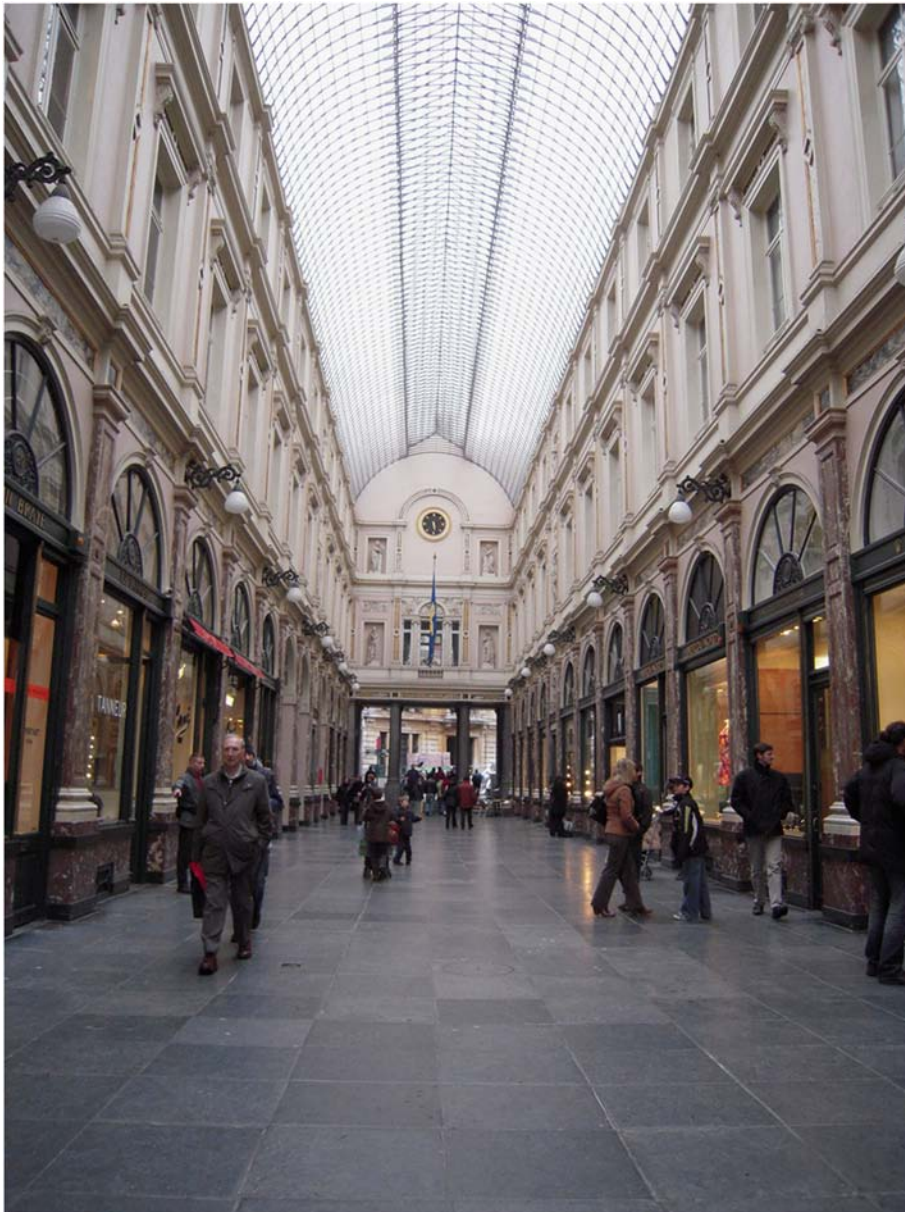
Plate 3. Galleries Saint-Hubert anno 2009

of the marbles used for flooring and decoration of the façades was set up and damaged elements were replaced by stones from the original quarry if possible. All new stones were carefully polished to match the original satin-like polish (RCMS, 1998). The original glazing of the glass roof has almost completely been replaced by new glazing at previous maintenance works. An aluminum stroke had been applied to