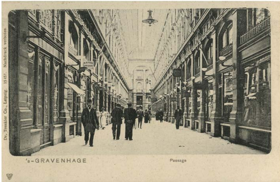
Plate 6. Picture postcard 1904

Conservation and management: The restoration of the Passage focussed on its functioning as an urban connection and aimed to restore the inner façades to its original condition. As such, the ornamentation that had been removed in the 1960's was reconstructed, based on historic photographs, and on few remaining ornaments in the rotunda that had been preserved and the terrazzo flooring was restored. However, the project lacked consistency as the reconstruction of material evidence was not done for all features. For example, there was no research to identify the original polychromy of the façades (R. de Boij, personal communication, March 10, 2010), although it would have been possible for some parts of the building. Instead, a contemporary polychromy was applied which had strong contrast between the different colors to accentuate the reconstructed decorations (S. Tol, personal communication, March 10, 2009). The original lanterns and advertisement has been replaced following a contemporary design.