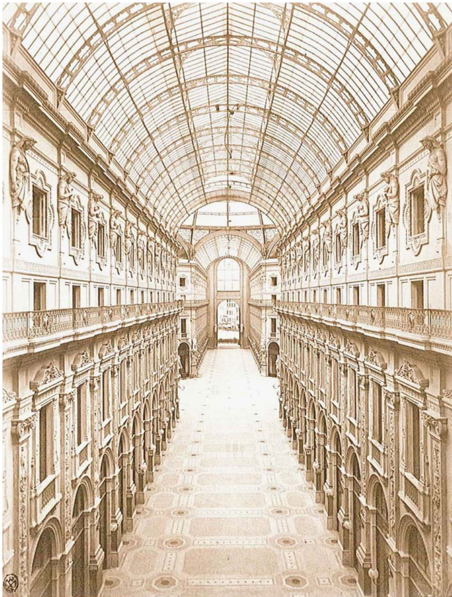
Plate 4. Galleria Vittorio Emanuele II anno 1867

Value assessment: The Galleria Vittorio Emanuele II represents the climax in the evolution of the passage as an architectural typology. As such, intrinsically the most important values are its monumental size and architecture as well as its program. Extrinsically, the building has been very well preserved and is still an important symbol for the city of Milan.