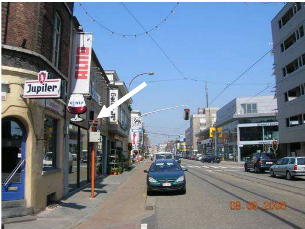
Figure 2: Housing using for optical PM device and diffusive samplers (see arrow)

NO 2 , which is also a traffic related pollutant is measured at all locations (weekly/(monthly average) by diffusive samplers. In one of the cities also the monthly averages of other traffic-related pollutants are measured (BTX and aldehydes) by diffusive samplers. Diffusive sampler can be fitted into small housing that can conveniently be placed on existing traffic signs or lamp posts. Although they are out of easy reach, they are often vandalized, causing loss of material and data (Figure 2).