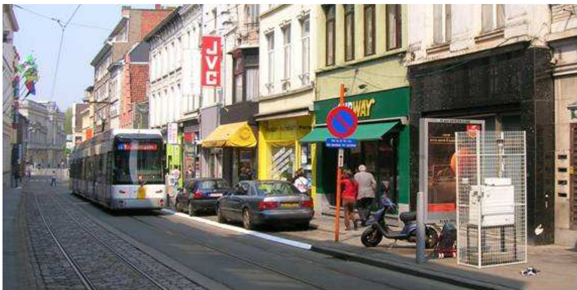
Figure 1: Sequential high volume sampler in a street canyon in Ghent

PM 10 daily average values are measured on at least 5 locations in the cities during 3-4 weeks representing different 'typical' traffic locations: e.g. ring road, access road, P route, local traffic, park. Most of the locations are kerbside sites. The measurements are performed according to the EU reference method (gravimetric) using a sequential high volume sampler. The measured values are compared to the EU limit value for PM 10 . High volume samplers require sufficient space to be placed on the sidewalk and should be protected (Figure 1).