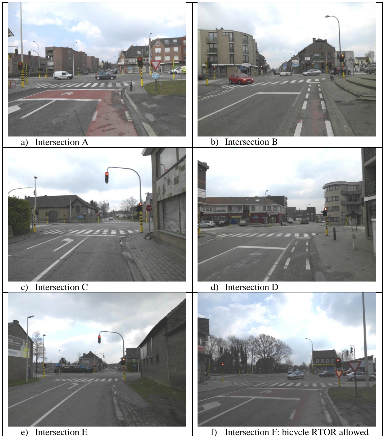
FIGURE 3 Pictures of bicycle RTOR situations.