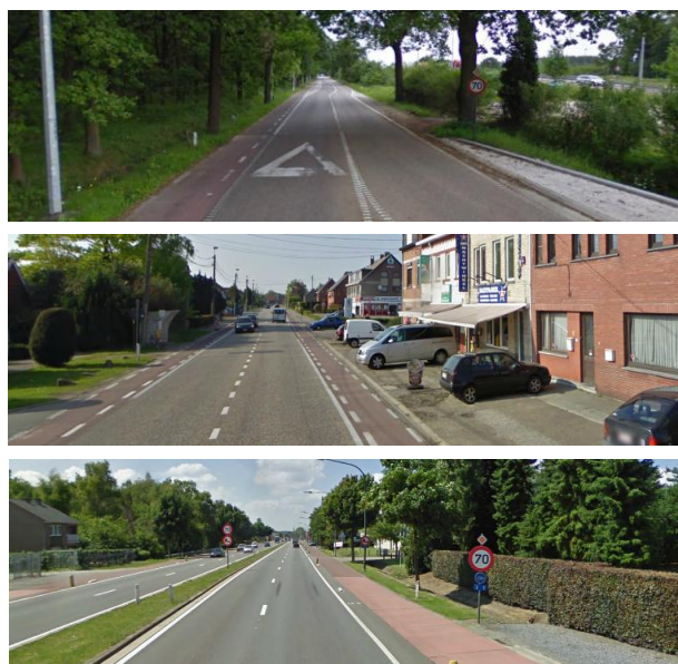
Fig.1 Examples of roads at which the speed limit was restricted from 90 to 70km/h