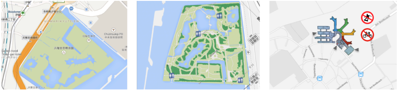
Figure 6: (a, left) Current web-based Google Maps (b, middle) Adaptation of a web-based Google Map of the same location (urban park) modified according to our design suggestions. (c, right) Adapted version of the campus map that implements a number of our design suggestions, e.g. showing rules of space, entries and highlighting different regions of the campus.

our corpus' campus maps. Second, we have used a similar deemphasizing approach as in 6b. Third, we have added two rules of space. Finally, we have added a layer that uses color to depict the different regions of the campus. While implementing the emphasis on the campus is relatively straightforward, doing the same for the other three changes would likely require similar approaches to identifying custom map orientations.