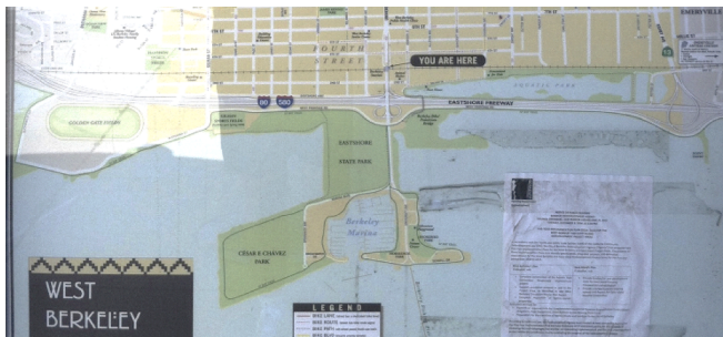
Figure 1: An example of a map in the “City Maps” category. This map, which is of Berkeley (CA), uses a “logically-aligned” orientation (discussed below), in which the map is rotated such that the coastline is horizontal. This map, like the others in this paper, have been cropped for space reasons.

We considered three types of base maps in our analysis of