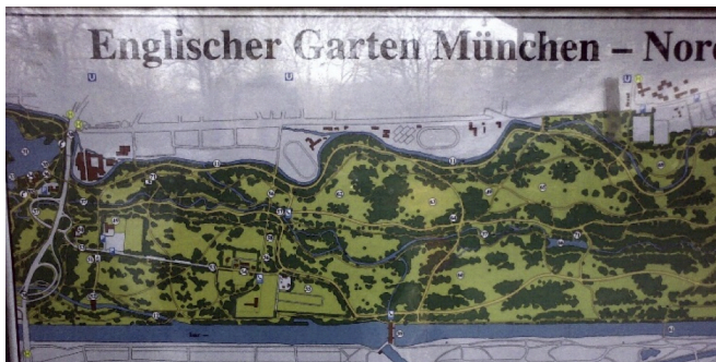
Figure 2: An example of a map in the “Urban Parks” category. This map is also “logically-aligned”.

base map use: standard, topographic, and satellite imagery. Standard base maps are those that you might see in an average road atlas and that are used by default in all online and mobile maps considered. Topographic base maps describe the elevation of the underlying terrain, typically using contour lines. Finally, a map that uses satellite imagery as a base map presents all of its information overlaid on top of a satellite image.