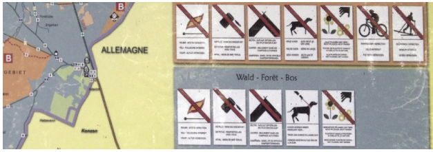
Figure 4: An example of a rural park map with a large number of space usage rules.