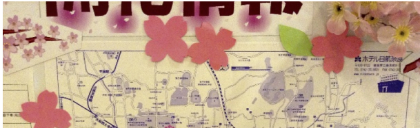
Figure 5: This map's cherry blossom "mapjunk" is quite useful for communicating sense of place.