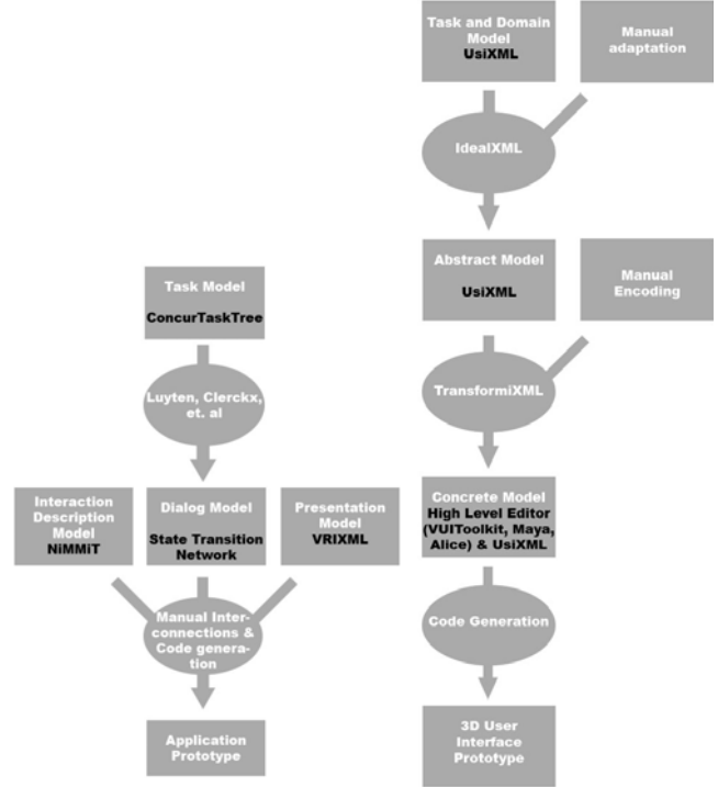
Figure 2: CoGenIVE and Veggie approaches

Once the Task Model is created it will be converted to a Dialog Model, denoted as a State Transition Network (STN). The STN is based upon Enabled Task Sets (ETS), which can be automatically generated from the CTT by means of the algorithm described by Luyten et al. [9]. Each ETS consists in the tasks that can be executed in a specific application state. Since we are developing Interactive Virtual Environments , we will only elaborate on the interaction tasks within the application. A possible example of such a task is object selection. In a typical form-based desktop application, selecting an item is a straightforward task in which the user selects an entry from a list. In an IVE however, this task becomes more complex because of the wide variety of selection metaphors (e.g. touch selection, ray selection, go-go selection).