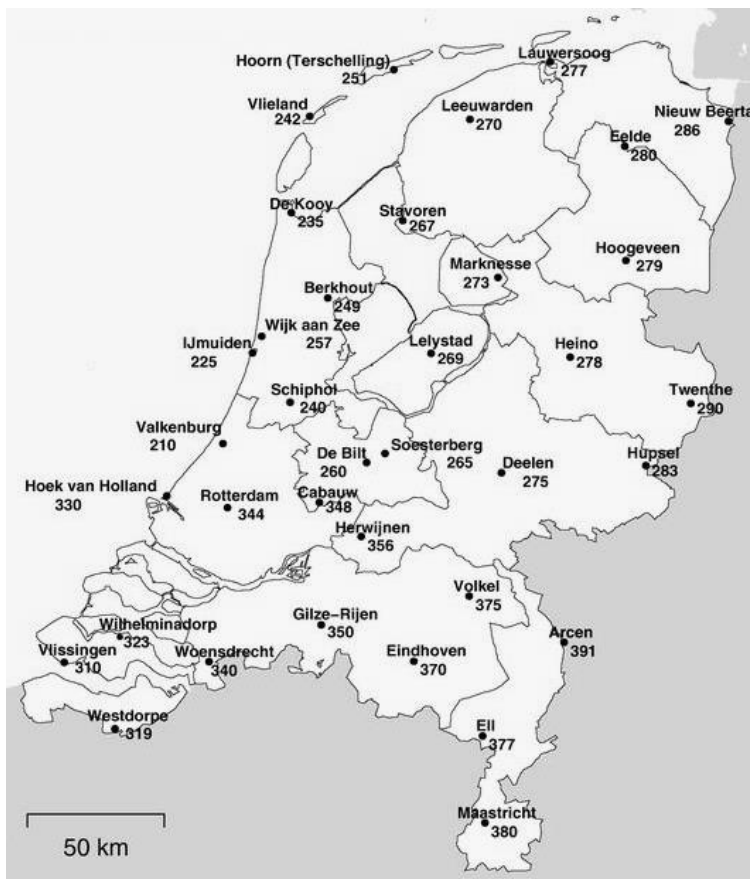
FIGURE 1 Locations of the meteorological stations (Sluijter et al., 2011).

The weather data used in the study were provided by the Royal Dutch Meteorological Institute (Projectteam Mon, 2008). These data included hourly weather data for the data collection period of MON2008 and were available for 36 weather stations in the Netherlands (see Figure 1 for the geographic distribution of these weather stations). The following types of hourly data are available: mean wind speed (in 0.1 m/s), temperature (in 0.1°C) at 1.50 m, sunshine duration (in 0.1 hour), precipitation duration (in 0.1 hour), cloud cover (in octants), fog formation (yes/no), snowfall (yes/no), thunderstorm (yes/no), and ice formation (yes/no).