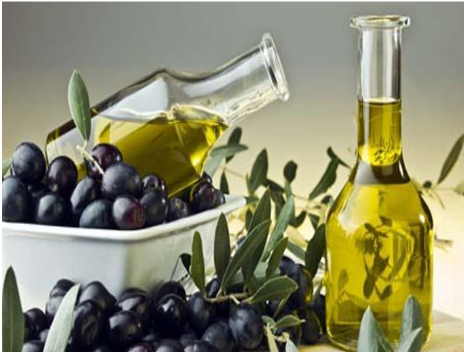
Title: The key success factors of exporting: The case of Greek Olive Oil and Olive Products