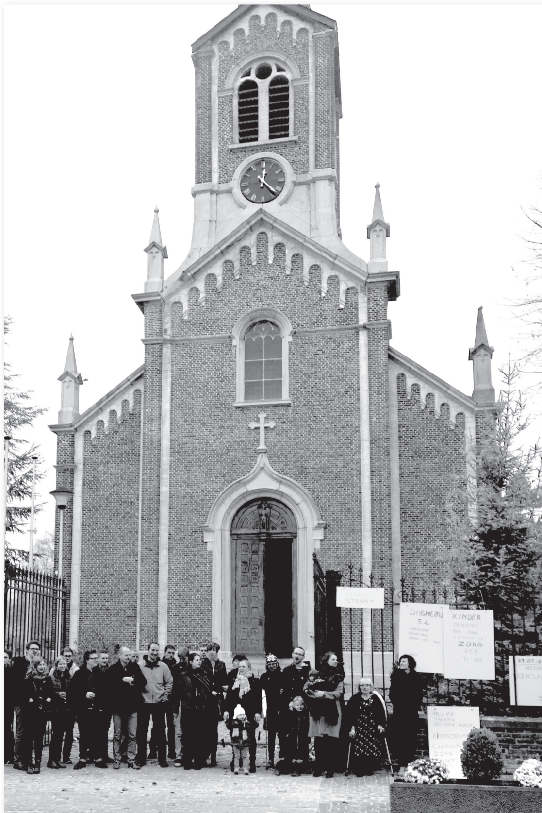
Residents celebrate the opening of their new community centre in the old church

TOGETHER THE INHABITANTS AND POLICY MAKERS APPROVE THE NEW USE OF THE CHURCH IN GODSHEIDE