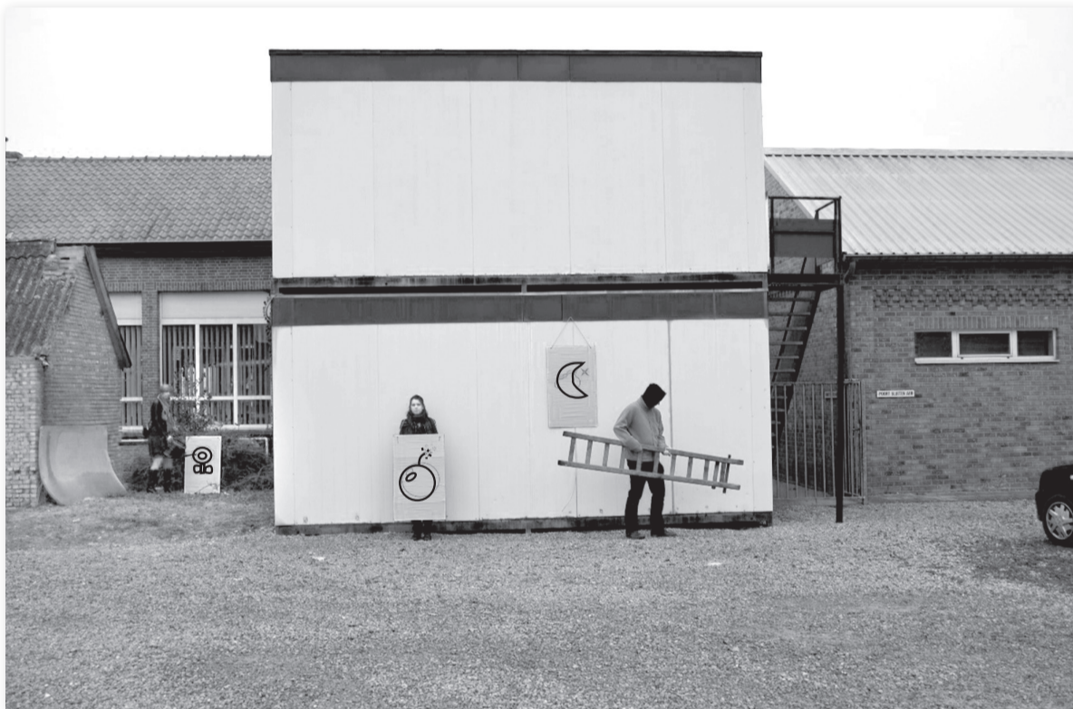
In 2014, the residents placed a bomb under the maintenance of the school

Yesterday was the festive opening of the new classrooms, ten years after the collapse of the local school in Godsheide. It puts an end to the use of the scouts premises by the children and their teachers. The construction of the new school was made possible by the crowdfunding initiatives organised by various groups and associations in Godsheide.