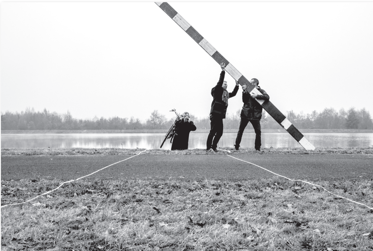
Residents stimulate the much needed bridge by the Godsheide canal