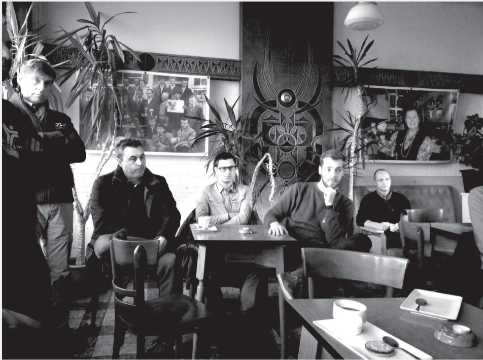
Residents meet up at "Bij Vieke"