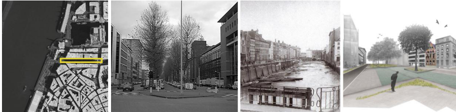
Fig. 3. Brouwersvliet: location – actual situation – situation at the end of the 19 th century - green promenade to the city

To restore this area into a low traffic zone, the green structure of the Brouwersvliet with its plane trees will act as a transition, a restorative environment, between the city and the Eilandje. Green environments play an important role in the field of soundscape. The rustling leaves introduce a soothing sound. Trees acts as natural sound sources, changing in time and depending on seasons. By implementation of the concept ‘refuge’ a new promenade to the river is created.