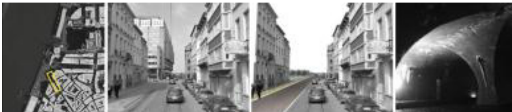
Fig. 2. St. Pietersvliet: location – actual view to the river – desired view to the river – ‘ruien’ chapel

Beyond this, the soundmark of Saint-Peter’s church is hardly audible due to the traffic noise. “When citizens heard the chiming of the bells, they felt rooted within a cultural geography that could easily be walked...Soundmarks provided local cohesion” [13]. Through redevelopment of this street into a fleet, the Bell Tower can reverberate again in the northern part of the city of Antwerp.