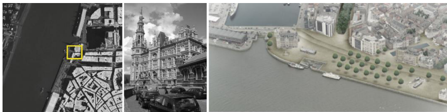
Fig. 4. Loodswezen: location – building – green promenade

In order to integrate the quay side with the industrial heritage, the road axis along the quays should be canalized and replaced by a tunnel. The application of the concept of refuge with the creation of a green infrastructure will reconnect this place to the river and the city. In addition, a larger green zone increases the restorative qualities of space [14]. Restoration does not only gain benefit from a positive soundscape, but also from the general composition of the place as a complex, coherent landscape, in which users would already visually recognize potentials for the variety in use, related to their contact with natural elements [15].