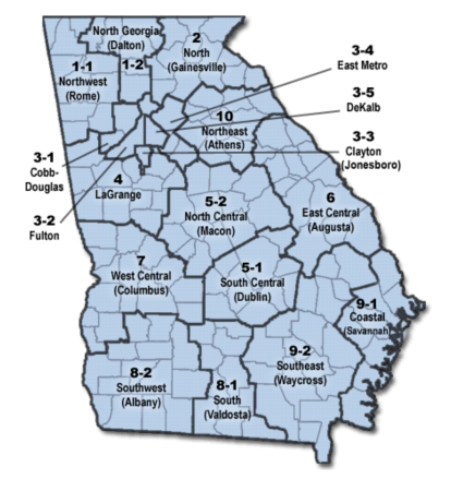
Figure 1. State of Georgia, USA: County and PH district boundary map.

The exploratory data analysis for the LBW incidence and median household income at both the county and PH district is shown in Figure 2. As can be seen from the figure, there is an increased risk of having a LBW baby in southwest of Georgia at the county level, while the median income in those areas is relatively low. Similarly, there is a high incidence of LBW at the PH level in the southwest region of the map, and a relatively small LBW incident is present in the northern GA. On the other hand, a relatively high income is observed in the northern GA. This shows that income may have a negative impact on LBW incidence. From the figure, we can also clearly see that scaling up smooths out the variation for both LBW and income. Our analysis of these data with and without the scale effect is deferred to Section 4.