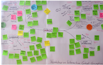
Figure 2: Mindmap result of WSICC'14.