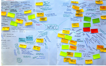
Figure 1: Mindmap result of WSICC'13.