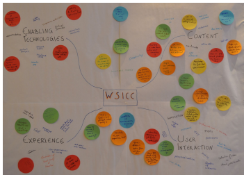
Figure 3: Mindmap result of WSICC'15. Available in better resolution on the website. All mindmaps are currently being digitized by the organization team to be further analyzed for scientific publication of the workshop results.