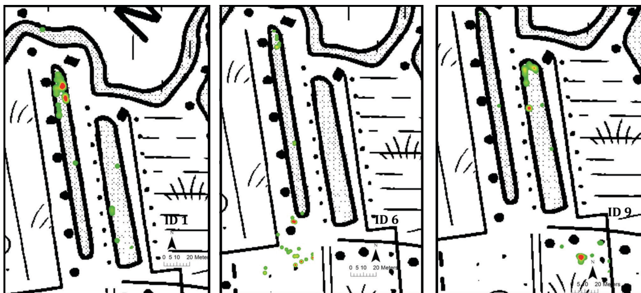
Fig. 2. – KDE50 and KDE95 locations (red and green, respectively) for the individual nr.1, 6 and 9 [see the online version for the colour figure].

As for hibernation, a study in Summit County USA showed that the bullfrogs favour relatively shallow (<1m) sites with algae and cattails, fed by small streams (STINNER et al., 1994). A habitat model made for the American bullfrog showed that the suitability of a wetland as winter cover can be expressed as a combination of the winter water depth and the relative amount of silt in the bottom substrates (GRAVES & ANDERSON, 1987). Another telemetric study in France revealed that 80% of the individuals of the American bullfrog hibernated under mulch in wooded area (BERRONEAU et al., 2007). The habitat choice for hibernation in this study was equally divided among the individuals. Fifty per cent of the investigated bullfrogs favoured the littoral zone of large permanent ponds, while the others preferred the wet soil in the alluvial forest. During the winter period only one individual showed some smaller movements, but in general