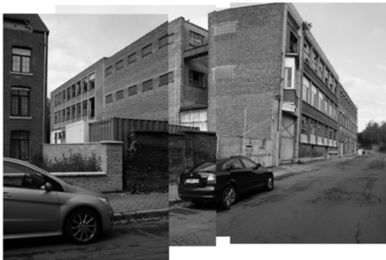
Figure 2. An industrial site in Verviers, Belgium.

This comparison of three cultural areas demonstrates distinct stages of and conditions for reutilization of industrial relics, and diverging conditions defining distinct spatial patterns of local peripheries. The social dynamics inherent to such diffuse settlement patterns delimit demand for continued use, which renders development strategies and policy ambitions problematic. The borders dictate diverging national policies across the area which even diversifies the conditions of each peripheral condition. Hence, this paper continues by