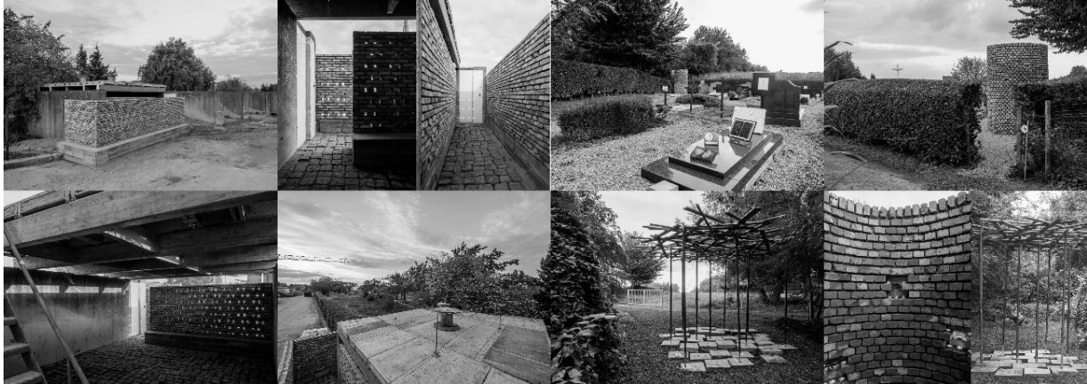
[Figure 3] Built construction by the end of the summerschool

meeting places on this route, and chose the exact locations or connections. As a next step we further (5) sourced the material and ambassadors. In an intensive summerschool the students stayed on location for two weeks (6) prototyping the constructions and (7) performing on site; by literally building and interact with local villagers. Only after the final event we set formal arrangements in (8) meetings with the village council and other actors to connect the actions on a longer term.