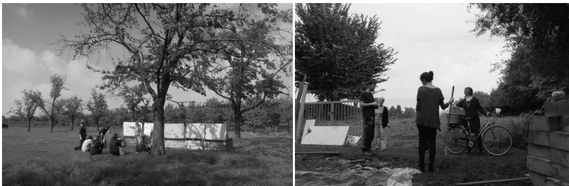
[Figure 2] A debate with villagers in an orchard [Figure 4] Constructing as a trigger for conversations

In the first three months there were 3 sessions where we walked these routes, each time with different teams of villagers, in a 4 th session the team consisted of participants of regional organizations and urban administrators. In between each session we visualized the different proposals that the teams made in collages. In the 4 th and last month there was a concluding and final game; a debate where all opinions, ideas and proposals were collected; at that point the policymakers came in.