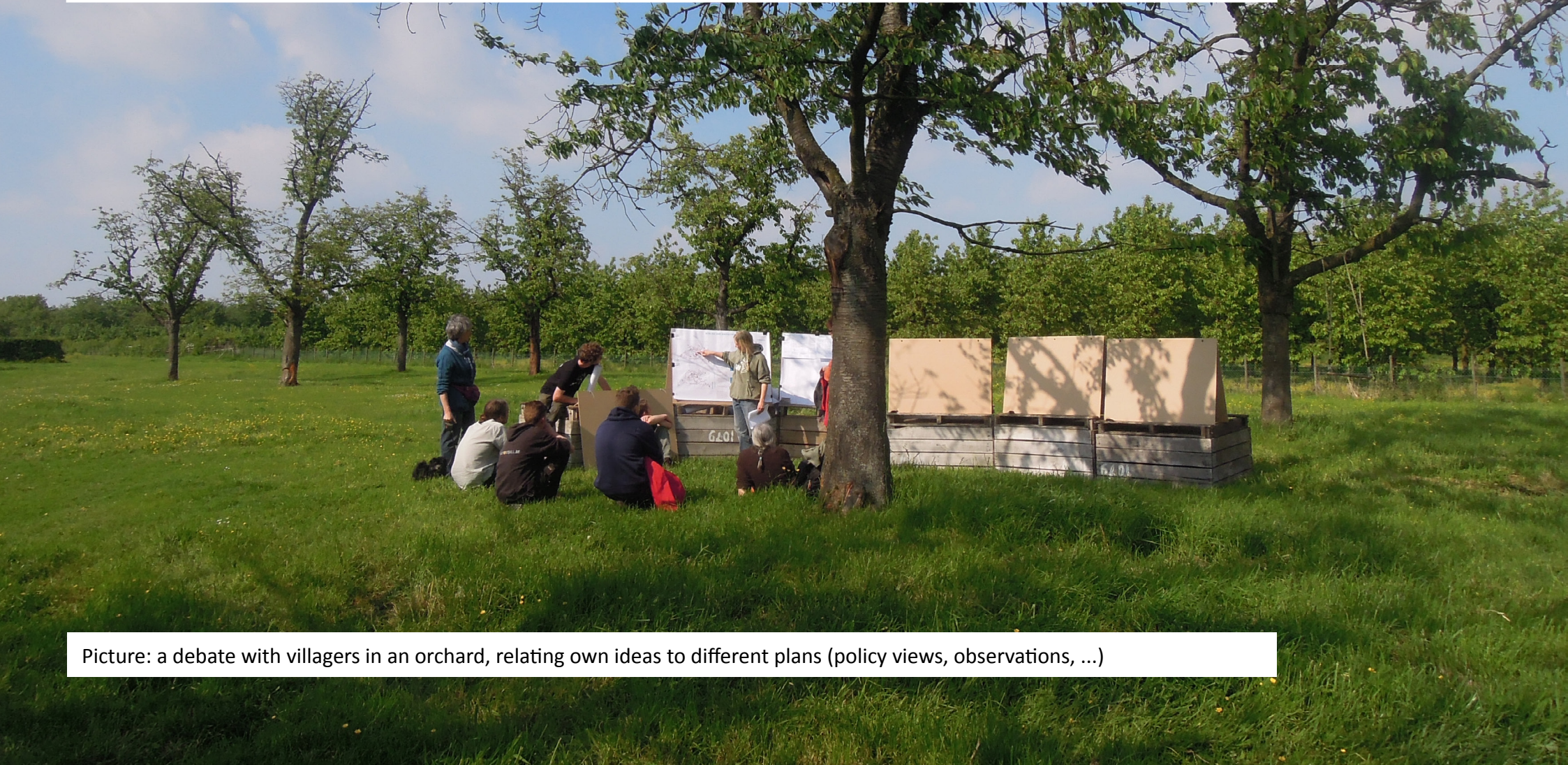
Picture: a debate with villagers in an orchard, relating own ideas to different plans (policy views, observations, ...)

in order to come to common or shared issues that connect local values with bigger challenges (as knots tying together possible perceptions, orientations and movements (Rancière, 2009))