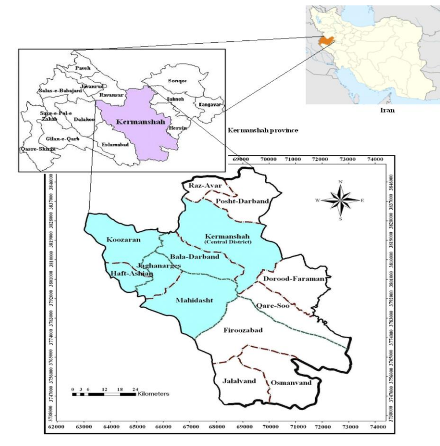
Figure 2. The study area.

The population of the study comprised the farmers who lived in Kermanshah Township containing six rural districts, i.e. Kermanshah (central district). Bala-Darband, Mahidasht, Jaghanarges, Haft-Ashian and Koozaran (Figure 2). The population of the study included 11200 farmers, with some farmers trained to select canola for planting. Using stratified random sampling method and Bartlett et al. (2001) table of sampling, a total of 212 farmers