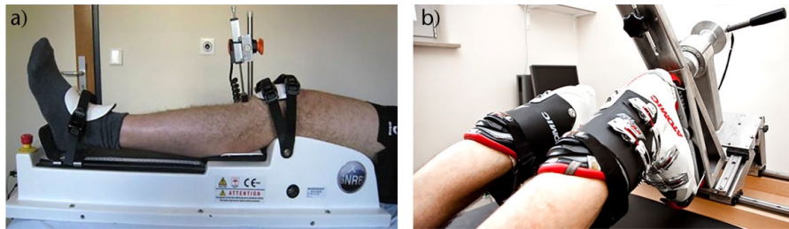
Fig. 3 Anterior and rotational knee laxity measurement devices: a) the GNRB: the ankle and patella of the tested leg are fixed and a motorised platform applies the anterior force behind the shank. The sensor placed on the tibial tuberosity measures the anterior displacement; b) the Rotameter: the individual is lying prone while wearing ski boots attached to the frame of the device. The handle bar allows the examiner to apply the torque both in internal and external rotation.