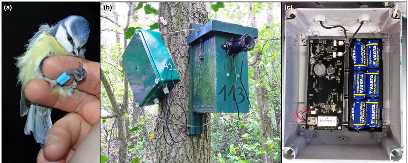
FIGURE 1 (a) An example of a PIT tag, here embedded in a leg band and attached to a blue tit. (b) Waterproof box containing the radio-frequency identification (RFID) logger mounted on a tree (left side) with antennas placed in front of the nest box opening. (c) Inner side of the RFID box, containing the battery holder, RFID data logger circuit, and a 1 GB memory stick for data storage and programming

box (Thermoplastic IP65 Junction Box, 220 × 170 × 80 mm; RS Components Benelux, Brussel, Belgium) and consisted of an electronic reader circuit (EM4102 data logger, Eccel Technology Ltd, Aylesbury, U.K.; Figure 1c). The logger was externally powered by six commonly used C-type batteries (1.5V, LR14, Varta Industrial, Germany). These batteries lasted for at least 3 weeks of continuous outdoor recording with average temperatures ranging between minimum 5.0°C and maximum 18.5°C. The logger further contained two connections to independent antennas, and a USB memory stick (1 GB) for data storage and to program the minimal sample reading interval (250 ms), the date and the clock to the nearest second. The logger with both antennas (inner diameter: 40 mm) was installed around the nest box opening (Figure 1b), at least 2 days before the video recordings (see below). Metal was avoided in the vicinity of the antennas, because it may reduce the PIT tag signal strength. Installing the antennas was done in less than 2 min to ensure minimal disturbance. Without exceptions, all birds ( N = 76 ) accepted this modification at their nest box and resumed provisioning behavior after 17.9 \pm 2.8 min (range: 2.2–98.9 min).