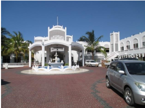
Figure 2. Beach hotel and resort