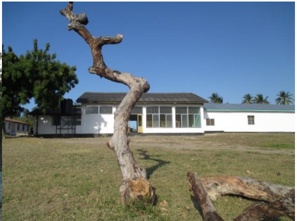
Figure 4. University buildings