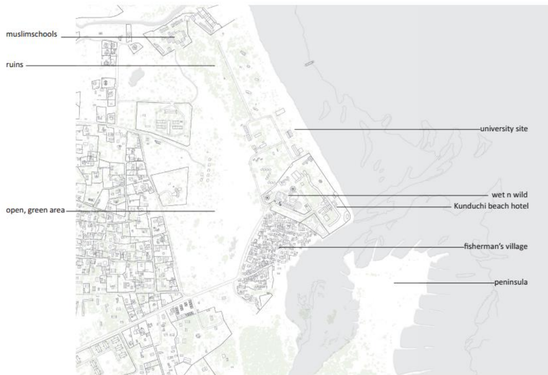
Figure 1. Different zones in Kunduchi.

The fishing village with houses constructed with waste materials is also not freely accessible. The fisherman communities along the Tanzanian coastline descend of the ancient Naga tribes [11]. With a rich past of trade, exchange of cultures and goods, an impressive knowledge of the sea and its fragile life, it is essential to transfer their (hi) story to future generations. When the fishermen obtain more economic stability they can preserve and strengthen the autarky system or self-sufficiency.