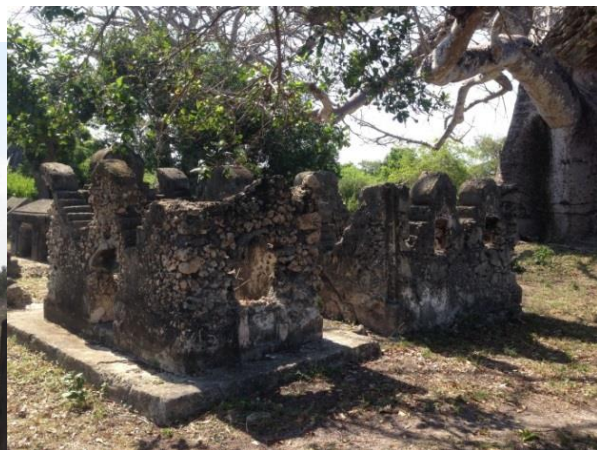
Figure 6. Ruins