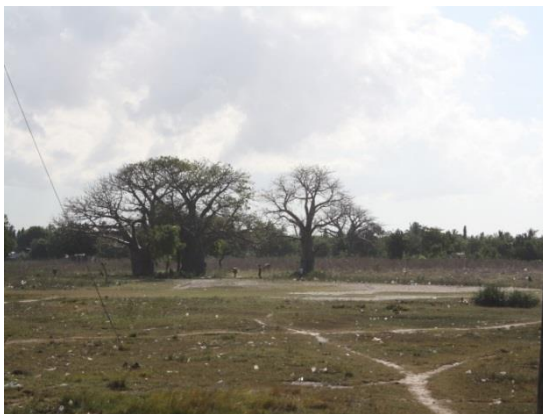
Figure 5. Green zone