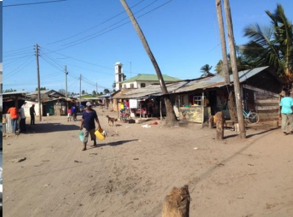
Figure 3. Fishermen village