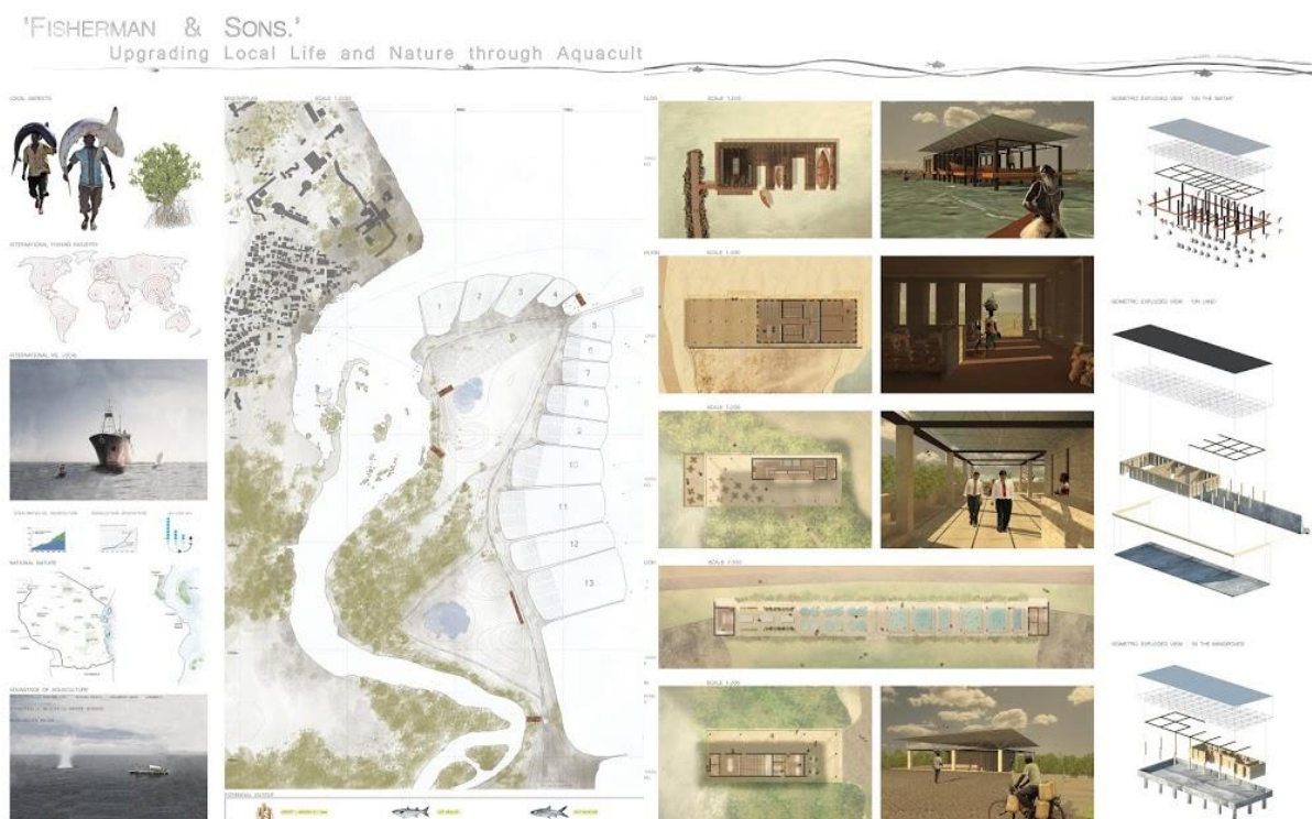
Figure 8. Fisherman and Sons [20].

The design proposes to transform the island into an eco-economic hub with extensive fish farming with installations of breeding zones and labs in combination with seaweed farming. In order to minimize the environmental impact of the intensification of the fish production, the Recirculating Aquaculture System (RAS) can be used [21]. The existing wave breakers will be used as ponds. The shallow zones are perfect for installing seaweed fields while the deep areas can serve as fish growing ponds. The architectural concept is expressed by a series of pavilions, designed with a specific architectural appearance that facilitates the new activities: a hatchery building, a workmen's space, a workshop space, an information point, and a restaurant. Although the pavilions have the same materials and dimensions, each of these pavilions has a unique relation with its surroundings. The pavilions blend into the landscape and accentuate surprising views on the nature reserve and its surroundings.