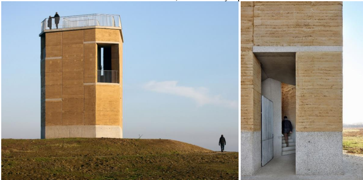
Figure 1 Watchtower on a hill in natural reserve (left) rammed earth walls with concrete base and core

To guarantee the quality of the earth construction, the design and construction team was supported by an international team of experts in rammed earth. These consultants defined a material mix (20% gravel, 40% sand, and 40% loess, stabilized with 6% hydraulic lime), using materials from nearby excavation sites (Section 5.3). Also, they advised on how to organize the construction site for in-situ earth mixing and rammed earth construction. Despite the consultancy, training of the contractor and follow-up, some issues arose during construction. This resulted in the use of cement instead of lime as stabilizer. The rammed earth works took 7 weeks, carried out by a professional contractor.