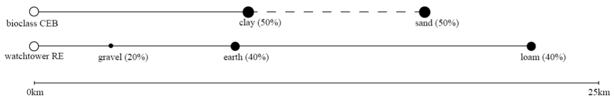
Figure 3 distance from site to material source

However, in both projects, special attention went to the transportation distance between the excavation site of the earth materials and the construction site. The architect of the watchtower project mentioned that pre-mixed earth with specified material characteristics can be bought (e.g. from a producer in Germany), but they preferred a mix of locally sourced materials. Testing was done with different mixtures of material in the region resulting in an earth mix with material taken from within a range of 25km (figure 3). For the bioclass, clay was bought from a nearby quarry, sand was bought at a local distributor. As the exact sand source is unknown, the distance on figure 3 represents the distributor.