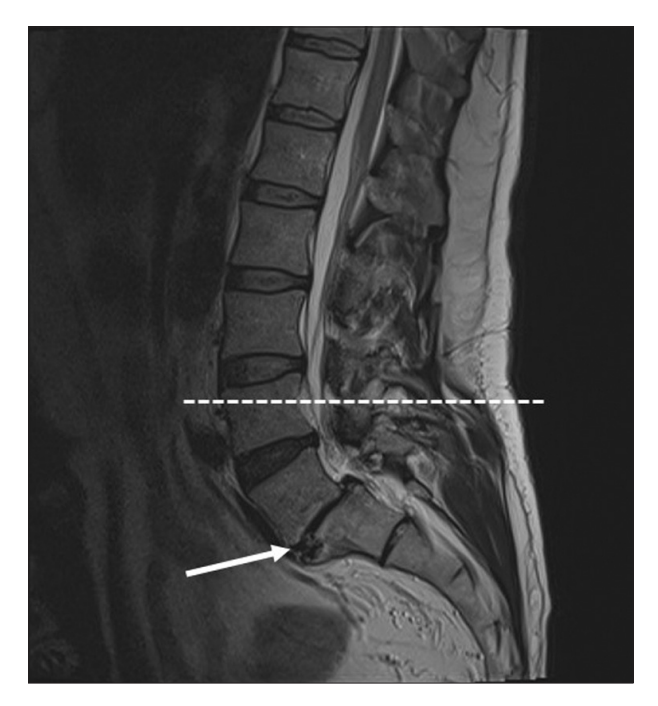
Fig. 3. Sagittal view of T2-weighted magnetic resonance imaging of the lumbar spine indicating discus bulging at L4-L5, pronounced degenerative disc disease at L5-S1 with pseudo-bulging caused by degree one anterolisthesis (white arrow). Biopsy level is indicated (dotted line).

ultrasonography was performed which showed a small insertional calcification on top of the iliac crest. Medical imaging could not provide us with an explanation related to our microscopic findings, but only showed severe spinal degeneration.