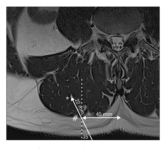
Fig. 2. Biopsy of the right paraspinal muscle. Distance between spinous process and biopsy site, 40 mm; biopsy angle, 35°; normal biopsy depth from fascia (#) into muscle (*), 22 mm.

Magnetic resonance imaging (MRI) showed no deviant findings within the paraspinal musculature. At the level L4–L5 there was slight bulging of the discus superimposed with a small medial hernia, but no impression of the anterior dura. Level L5–S1 showed pronounced degenerative disc disease with pseudo bulging caused by a degree one anterolisthesis (Fig. 3). As a result of anterolisthesis and disc degeneration, caused by a bilateral isthmolysis there was bilateral foraminal stenosis. Both left and right multisegmental degenerative arthritis of the facet joints was present. Because MRI imaging could not provide a solid answer to the origin of the lesion, an