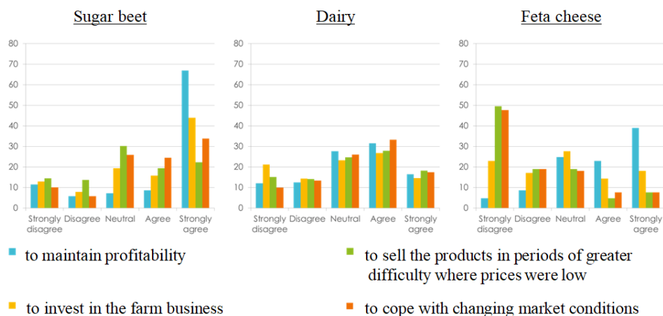
Figure B3. Economic sustainability (%) at commodity-level.