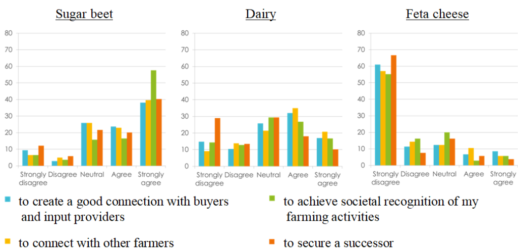
Figure B2. Social sustainability (%) at commodity-level.