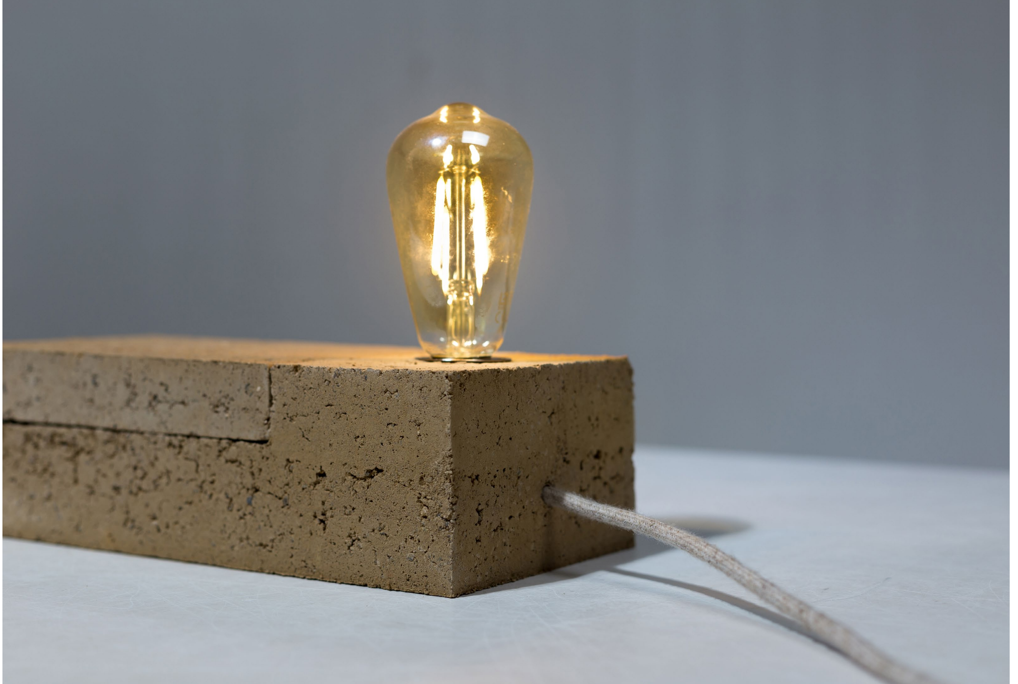
MONK design rammed earth