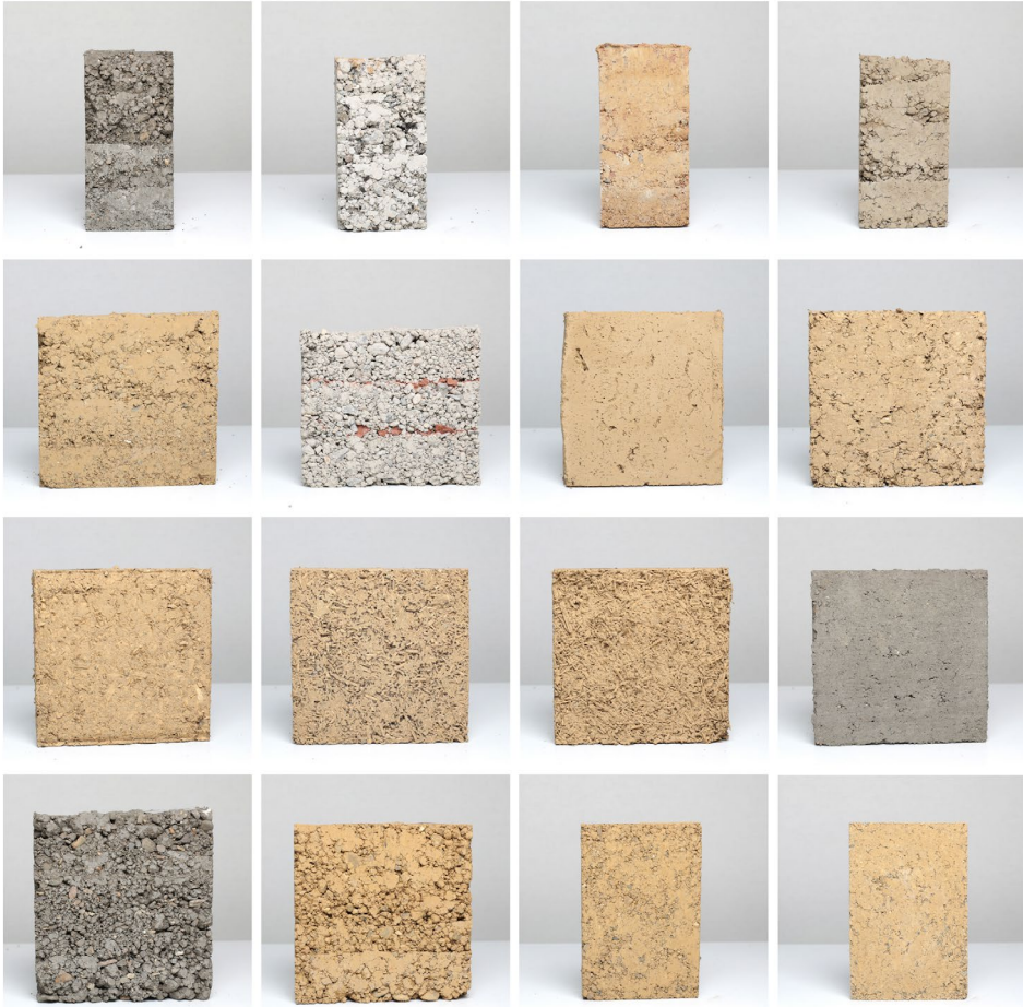
Earth raw materials Earth material samples