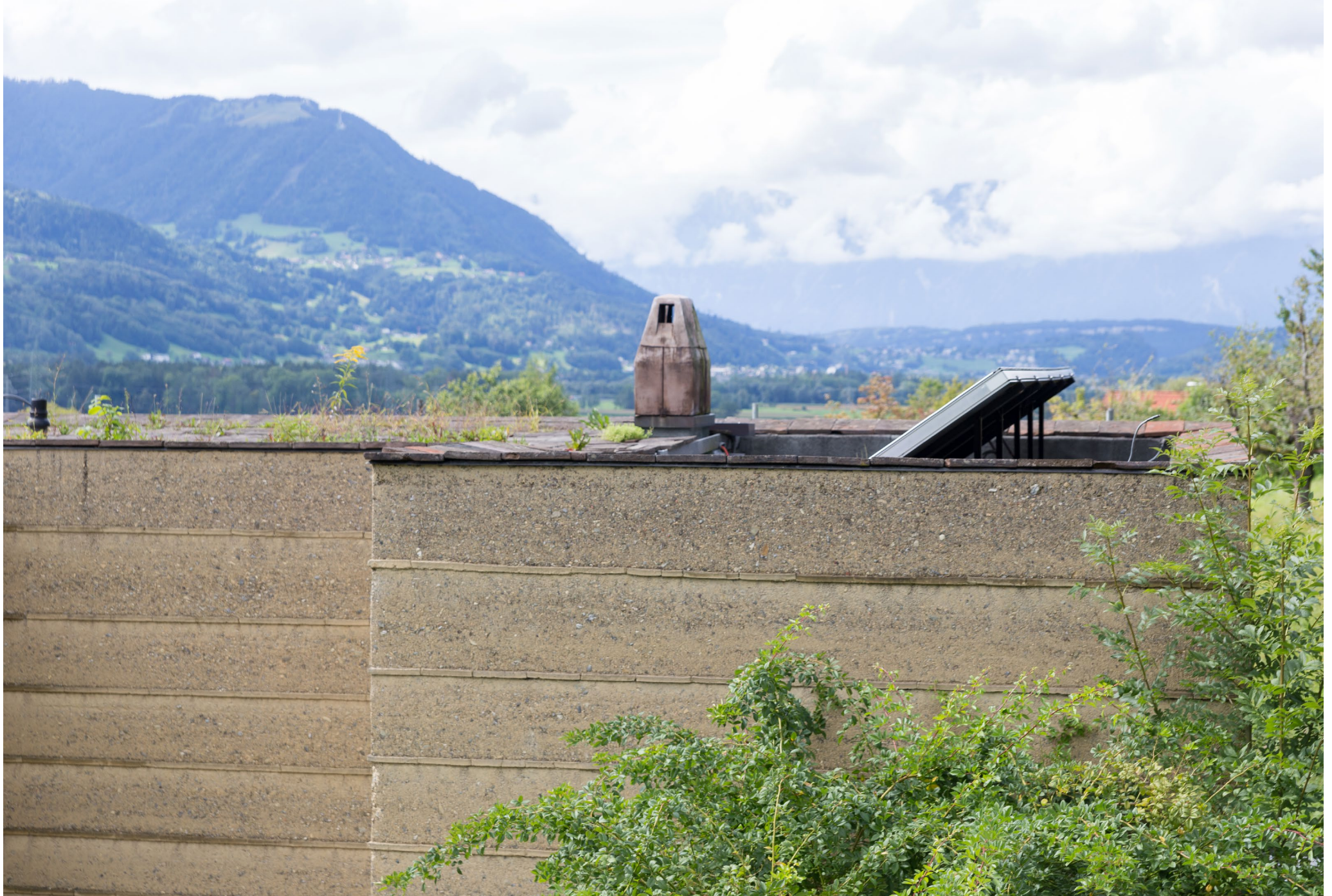
House Rauch, 2005 architect: Roger Boltshauser

earth in contemporary western-europe low impact: abundant, low energy and harmless at end-of-life but, if applied,