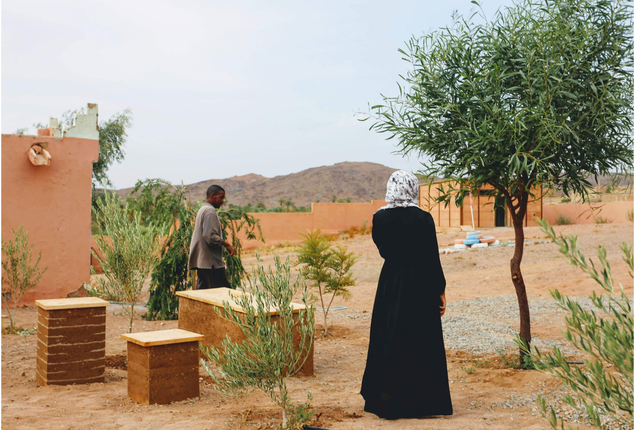
Workshop Beyond Borders, Ouled Merzoug, Morocco image: Jasper Van der Linden, 2019