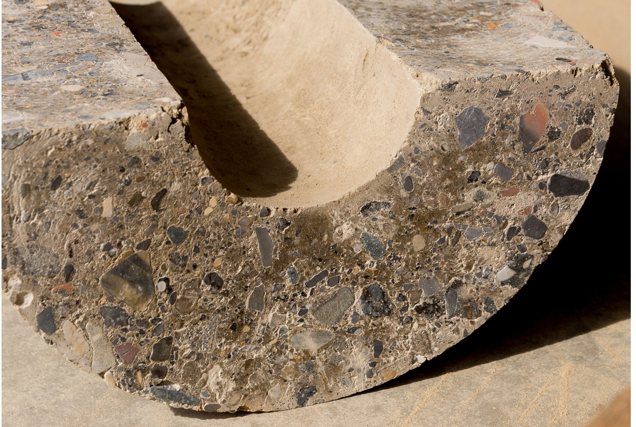
Advanced rammed earth workshop, polished rammed earth surface Bc Materials, Brussels image: Jasper Van der Linden, 2019