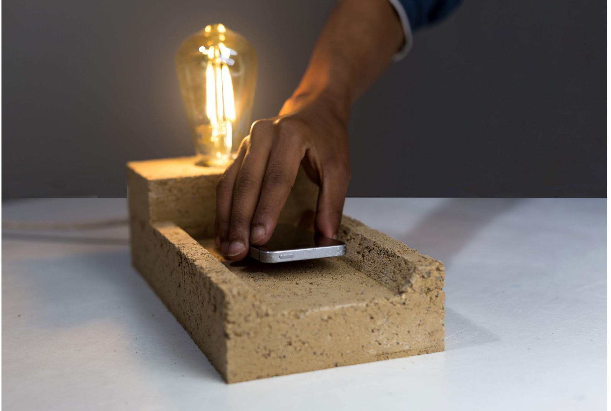
MONK design rammed earth image: Jasper Van der Linden, 2019

create material experience vision goal: attraction / means: refined, imperfections, naturalness