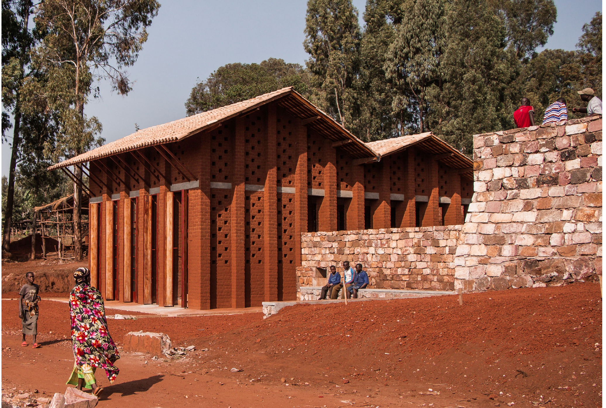
Muyinga library, compressed earth bricks image:BC architects, 2013