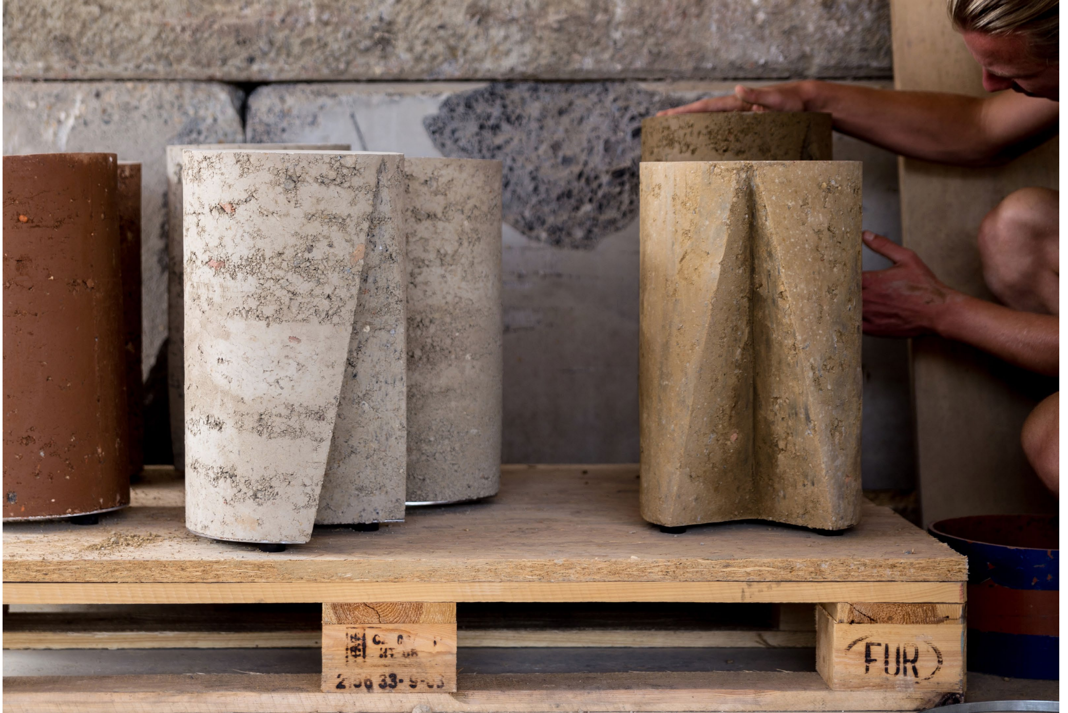
Advanced rammed earth workshop Bc Materials, Brussels image: Jasper Van der Linden, 2019