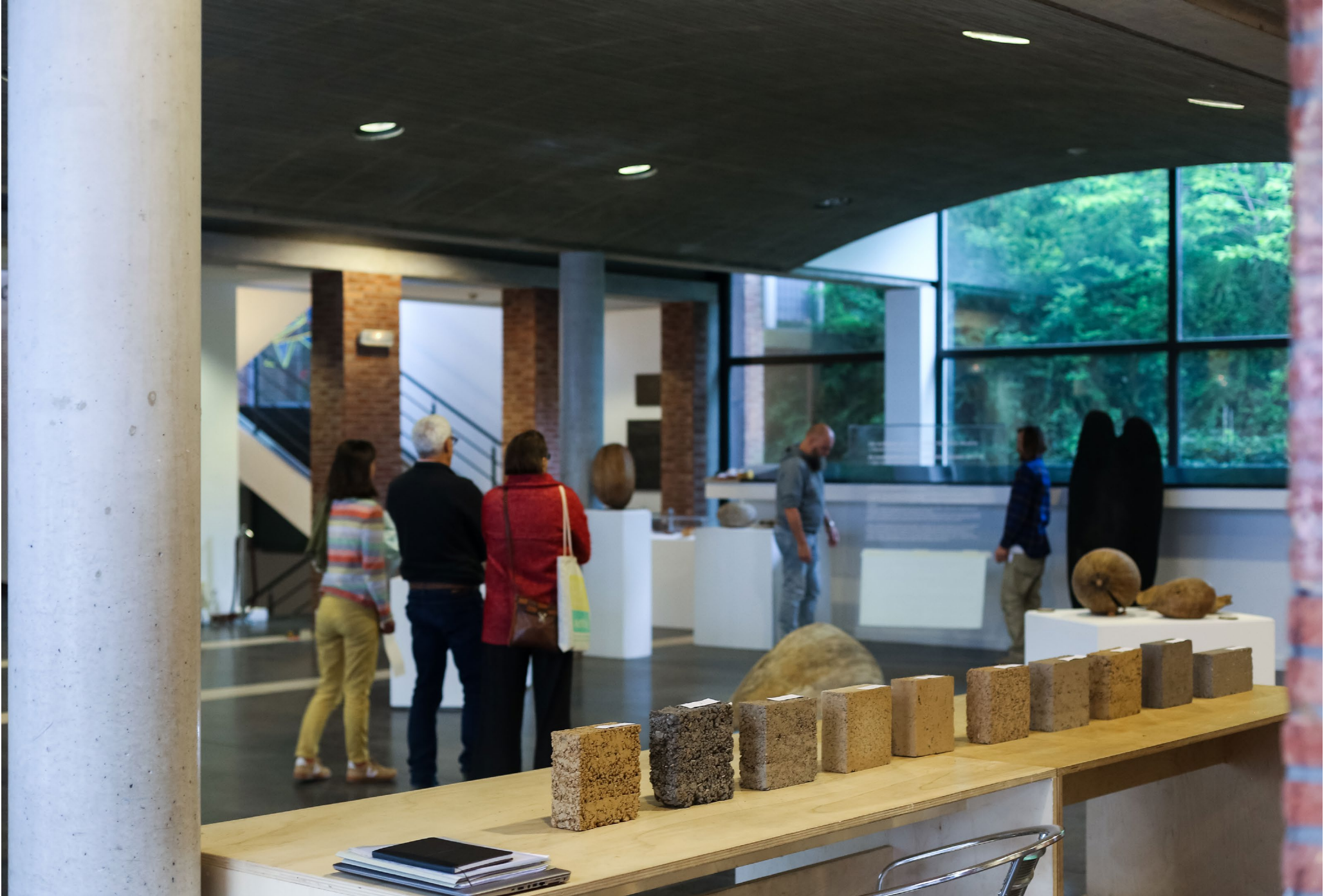
set-up for material experience survey & interviews Civa, Brussels