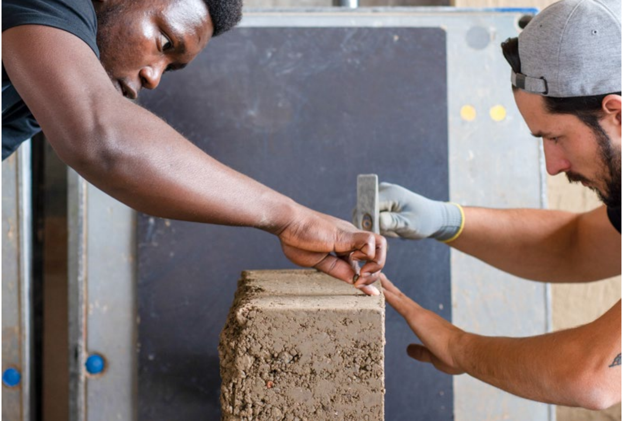
Advanced rammed earth workshop Bc Materials, Brussels