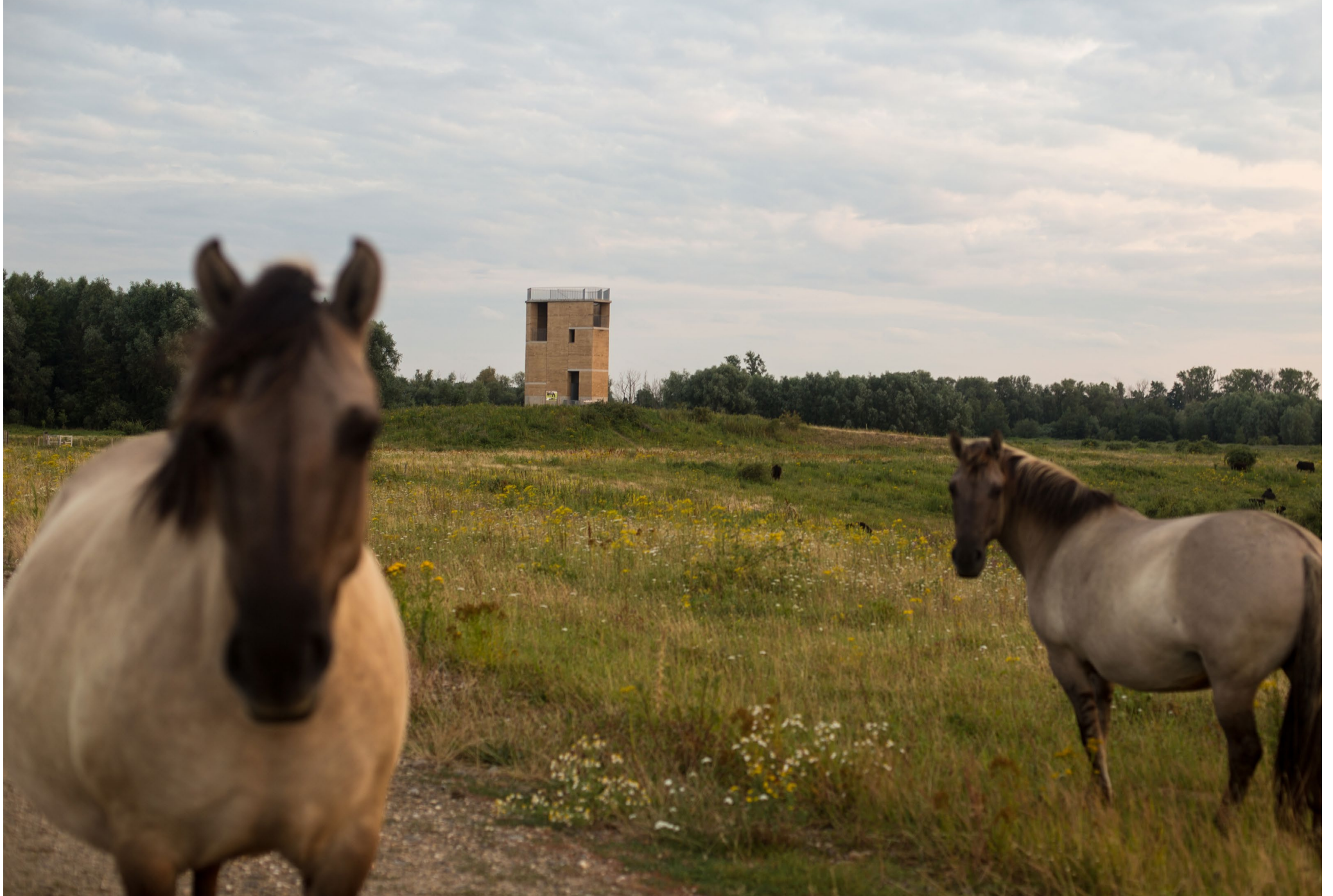
Observation tower, Negenoord architect: De gouden liniaal. earth expertise: BC studies image: Jasper Van der Linden, 2019