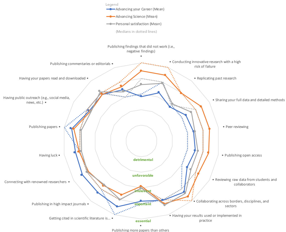
Figure 2. Mean and median ratings on each dimension for each statement.

The survey also allowed participants to comment after each item. These comment boxes were rarely used, but the few answers collected provide richer insights about some of the elements included in the survey.