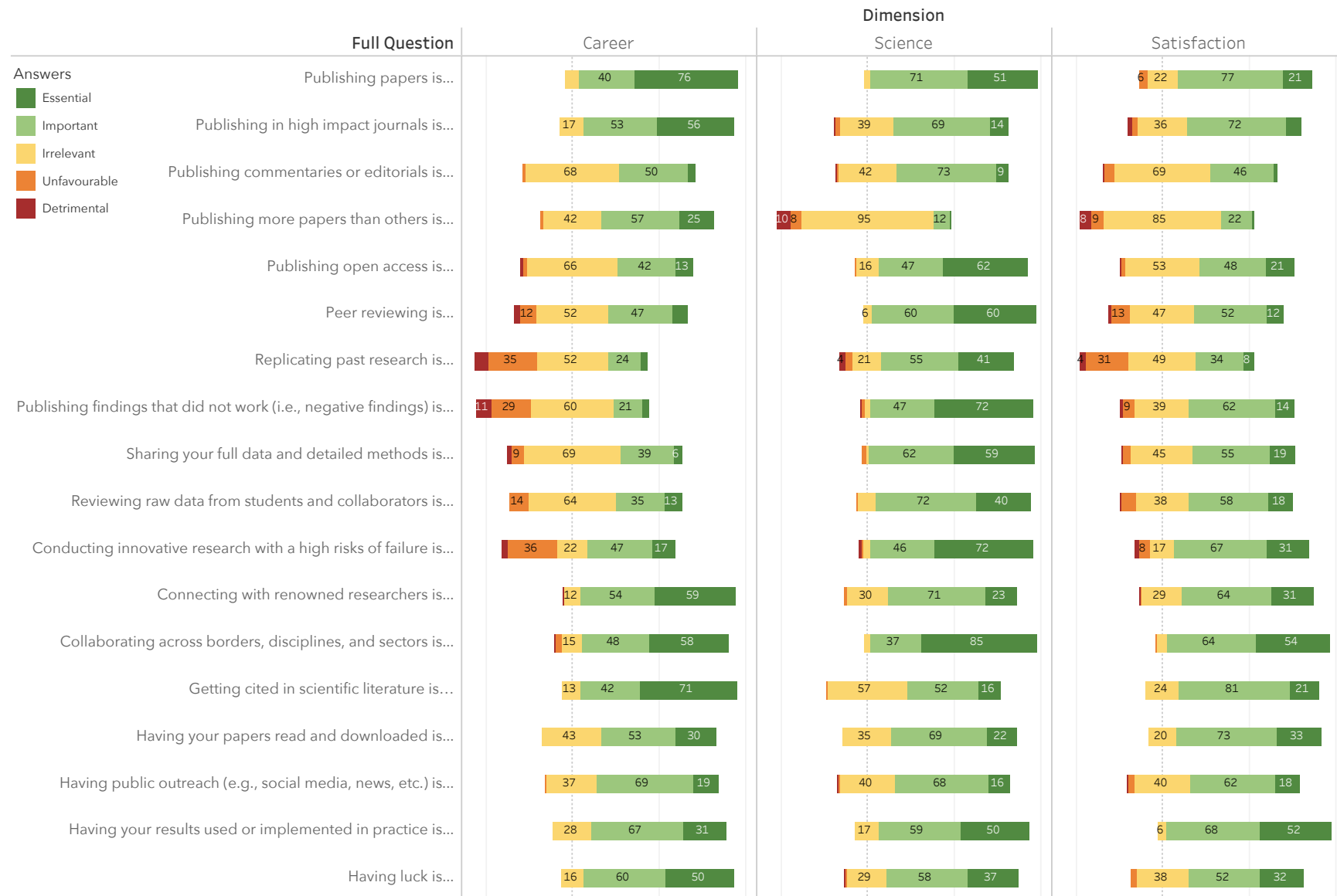
Figure 3. Distribution of answers for each dimension of each statement.