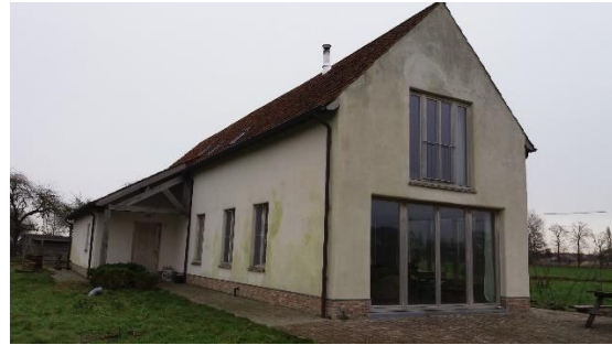
Case 2: New construction (2014), timber frame construction with lime hemp infill (38 cm)