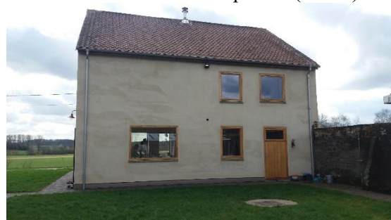
Case 4: Renovation (2014), existing massive masonry wall with lime hemp exterior insulation (15 cm)