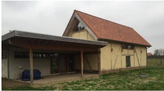
Case 1: Renovation (2016), existing half-timbered barn insulated with lime hemp (30 cm)

As drying of lime hemp is a slow process during which the \lambda -value improves, all investigated lime hemp walls were cast at least 1 year prior to the measurements. However, the year of construction needs to be taken into account when analysing the results.