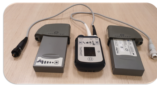
Figure 2 The extracorporeal parts of the HeartMate 3 system including batteries and controller.

This is the speed of the internal rotor spin and is displayed as revolutions per minute. The different devices have different ranges of working device speeds and speed change increments. Pump speed is fixed and set for each device by the LVAD team using specialized equipment. Current devices are programmed to temporarily reduce the speed to a set value in case of diminished blood flow to the device. This lower speed is also set by the LVAD team.