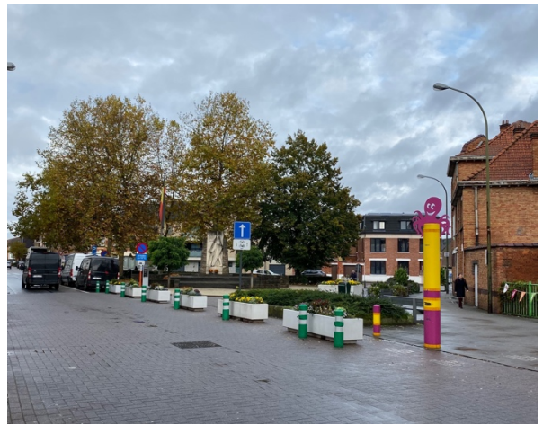
Figure 4: test set-up at the central square

The co-creation phase resulted in an alternative neighbourhood mobility plan. It was part of our original agreement with the city that we would gradually test this plan on different locations in the neighbourhood: implement a first test set-up, evaluate it, make adaptations if necessary and then proceed to the next phase.