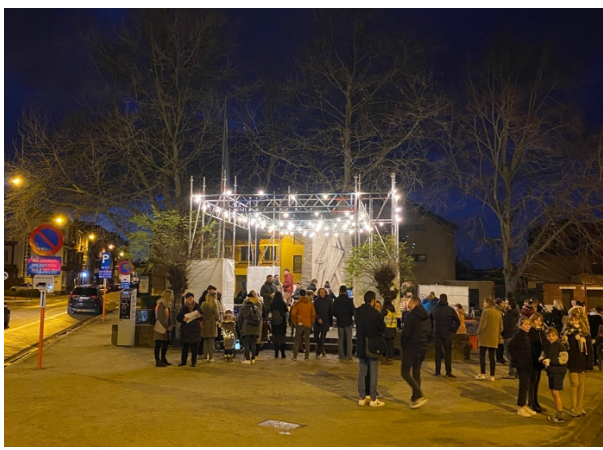
Figure 5: light installation during the winter walk

set-up, the square is used as a meeting place and a playground for children after school hours. The rediscovery of the square was celebrated with a light installation that we placed on the square during a month mid-January 2020 and was accompanied with a "winter walk" for children organized by the parent committees of two schools together with the action committee with the support of the shop owners and the city (see Figure 5). This action emphasises the change in the positions of the different actors and the shift in the process from mere car accessibility to liveability. It shows that the square is not an abstract space but a co-constructed and political space (Light & Miskelly, 2019).