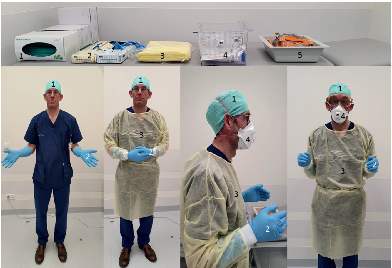
Figure 1. (A) Schematic figure of the donning and doffing procedure for personal protective equipment (PPE) in the outpatient rhinology clinic. (B) Illustration of the real-life PPE-procedure.