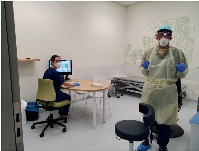
Figure 2. Real-life illustration of the examiner and buddy positioning with personal protective equipment.

pesticide-registration/list-n-disinfectants-useagainst-sars-cov-2. Published 2020).