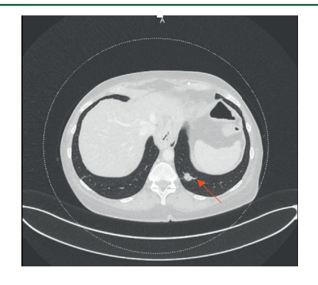
Baseline abdominal CT-scan