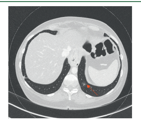
Reevaluation abdominal CT-scan