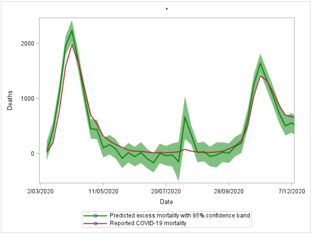
Figure 2. Reported COVID-19 mortality versus predicted excess mortality by the state-space model.