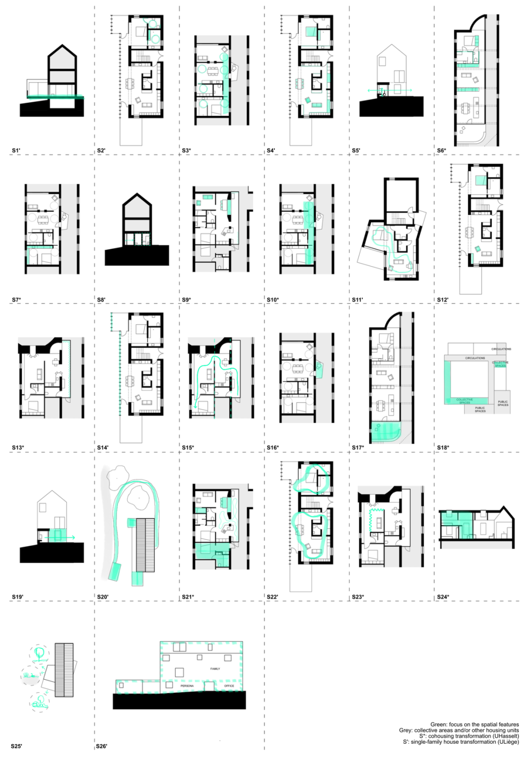
Figure 3. Schemes of spatial features implemented by the students to support ageing well at home.

Finally, students considered the "environment type" of the location. They took into account the surroundings of the habitat in the design reflection by, for instance, designing windows framing certain views and landscapes, or rooms facing the creek and the vegetation (S25').