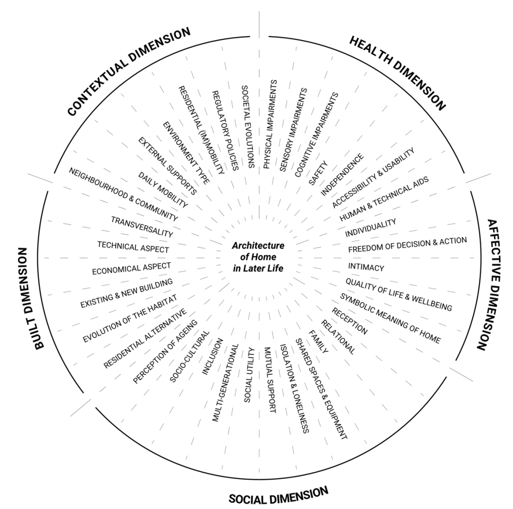
Figure 1. Theoretical framework used for the students' workshops (with the five main dimensions in bold, structured in 36 additional themes).

The pedagogical experimentation was conducted in design studios with students in (interior) architecture. Two workshops were set up, each with their own constraints, requirements and challenges, but with the same objective: to understand how, based on building data (i.e., an existing building to be transformed), human data (i.e., personas to be considered), as well as objective and subjective inputs (i.e., dimensions and themes introduced above), future (interior) architects reflect on housing for older people. The first workshop took place at the Faculty of Architecture and Arts at Hasselt University (Belgium). During three months in 2019, one day per week, seven Master students in interior architecture worked on the renovation of a monastery based in Ghent (Belgium), with the intent to transform it into a cohousing project for people aged 55 and over. The second workshop took place at the Faculty of Architecture at the University of Liège (Belgium). During one week in 2020, every day, nine Master students in architecture worked, in groups of three, on the transformation of a single-family house based in Lochau (Austria) into a home for an older couple/person. Due to Covid-19, this second workshop was held virtually.