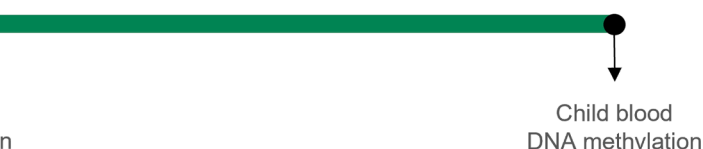
Fig. 1. Analyses scheme.

Residential surrounding greenness: 3 studies (N=1,849)