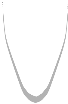
Fig. 2.5.1. Region represented by the constraint relation \{x^2 < y \wedge y < x^2 + 1\} . The program of Example 2.5.1 will not terminate given this constraint relation as input.

In the first statement, the program initializes relation variable X to the set of pairs of points in S for which the closed line segment between them also lies entirely in S . Then, in the while-loop, X is transitively closed. If the while-loop terminates, then the final value of X will hold all pairs of points in S that are connected by a piecewise linear curve lying entirely in S . For example, on constraint databases D where the semi-algebraic set represented by D(S) is actually semi-linear (cf. Definition 2.3.6), the while-loop will always terminate. An example of a database D on which the while-loop will not terminate is given by D(S) := \{x^2 < y \wedge y < x^2 + 1\} ; this constraint relation represents the (unbounded) region between the standard parabola and its translation by one unit up the y -axis. An illustration is given in Figure 2.5.1.