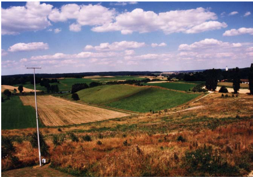
Figure 1: fallow land in a highly productive agricultural area in Germany

Production base for energy plants - However, the production of bioenergy from food and forage crops has several critical disadvantages. Harvesting food crops for biogas production is not sustainable and not cost effective, as the valuable plant product that has been bred for decades to yield optimum nutrient content for food and feed, and not necessarily for fermentable biomass, is directly converted to gas and then end-oxidized at a relatively low economic yield. Furthermore, the biofuel production from food and fodder plants reduces the available amount of agricultural area, thus increasing food and fodder prices. Moreover, poorer countries and less developed agricultural regions will suffer significantly from this shortcoming, and they will have even less chances to develop sustainable production systems. Especially in the Mediterranean, agricultural production is limited by water availability and soil quality. The lack of financial resources on the farms leads to neglectance of the production base, the soil, and finally to soil degradation. These areas are usually abandoned and set aside; they are not available for food production. It turns out that the present development is at the verge to become non-sustainable, similar to our previous behaviour. The only way out of this dilemma is breeding novel plants for energy production that are able to grow in so far unexploited soils, enhance their capacity to build up biomass, and provide them with resistance against pests.