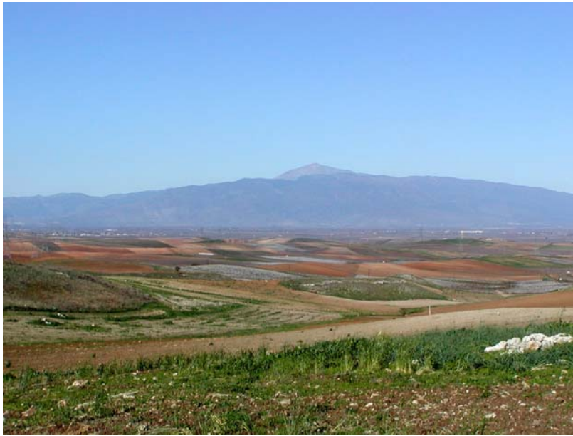
Figure 2: View of an agricultural region of northern Greece. Different soil colors depict fertile and infertile areas. Abandoned land with eroded and low organic matter soil is more obvious around the area closest to the photographer.

Taking this into account, fast breeding methods must be employed to yield novel plants with traits needed in the bioenergy industry, and abandoned marginal and degraded agricultural land must be used for their production. Promising species have to be tested for their suitability to produce readily digestible carbohydrate, protein and oil, and to be cropped in rotation with legumes and local (weed) species. These monocultures of novel plants will require novel plant protection measures as well as crop rotation protocols to ensure sustainable productivity. When farmers will grow novel energy plants in crop rotation with local plants and leguminous species, they will start to enlarge the local production base. After harvest, the biomass will feed biogas production in the dry fermentation process. The electricity system of the local community will be stabilized at low cost, and the process heat can be used for heating. Consequently, the digested solids will be used to ameliorate the land and improve the soil quality. Such knowledge based biotechnologies will provide the farming community with an opportunity to increase energy and food availability, to reduce energy costs and increase quality of life, to conserve fossil fuel reserves, fight climate change and create novel economic opportunities for small farms.