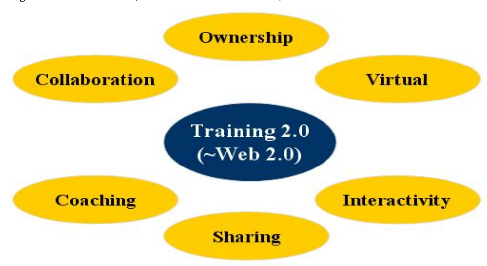
Figure 2 How we learn (see online version for colours)

Learning is no longer an individual activity, as can be seen in Figure 2.