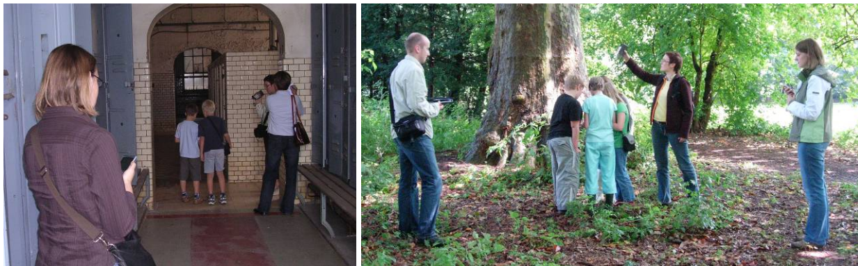
Figure 2: The "wizard" sends location information to the game PDA.

Using the Wizard of Oz application, location information could be sent to the game to help the children finding their way, or to trigger a new task. During field tests in the nature resort and the mine museum, ten groups of two to four children played the game. Simultaneously a researcher (wizard) operated the Wizard of Oz application (see Figure 2). Although the wizard was participating to the test, the test users did not notice that the location information was passed on by the Wizard of Oz application. Afterwards children were enthusiastic about the game and they even asked if this prototype can be used to play location-based games at home.