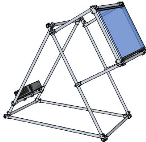
Figure 1: Setup of the multi touch table

These multi-touch screens have been tested before in public spaces. For example, for 8 days during summer 2007 in Helsinki a Multi-Touch screen was located in the street using an application where users were able to watch, move and rotate pictures. 1199 persons stop to interact with the screen. This study shows that these types of multi-touch interactions are appealing for a lot of people, and therefore Multi-Touch surfaces are suitable for public spaces [10].