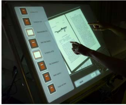
Figure 5: Library application

usability test, users seem to find using the multi-touch display both appealing and fun. One example is our implementation that provided multi-touch interaction with Google Earth 2 . Nearly all users tried to find their house by navigating through the map using both hands (and multiple fingers). These users had different backgrounds, ranging from people that have experience using Google Earth to others that did never hear from this application. We find that most users tend to use both hands and multiple fingers intuitively when interacting with the applications described in this paper.