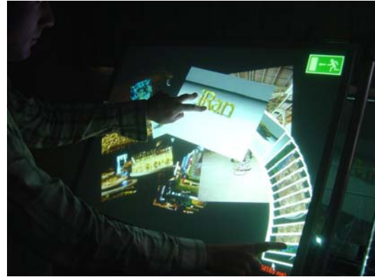
Figure 4: Video browsing